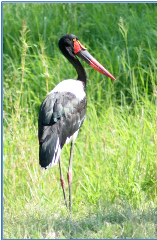
Figure 1. The saddle-billed stork.

the word ba was written variously with signs representing a stork (G 29), a ram (E 10), a human-headed falcon (G 53), and, in the Pyramid Texts (e.g., spell 1027b), a leopard's head (F 9). It remains, however, disputable whether the ba of this spell has the same meaning as it does in other contexts. The stork of the G 29-sign represents both the earliest and the most attested depiction connected to the religious concept of the ba . Fortunately, this ba -sign (G 29) can easily be recognized as the saddle-billed stork, Ephippiorhynchus senegalensis (see figs. 1 and 2), since it usually shows the bird's most characteristic features: long legs, long neck, a strong and sharp bill, and most importantly, the presence of a wattle (under the bill) or a lappet (at its chest). This bird should not be mistaken for the (American) jabiru ( Jabiru mycteria )—an error made by Gardiner in his Grammar (Gardiner 1950: 470).