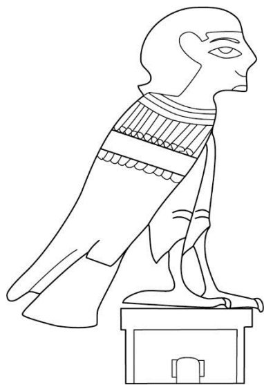
Figure 5. The hieroglyphic sign of the ba (G 53).

scene where other birds usually occur (Boessneck 1988; Houlihan 1988: 25; Decker and Herb 1994; Ikram 2005: 153-154). These facts have led scholars to the conclusion that the bird disappeared from Egypt during the first half of the Old Kingdom, or its distribution area shrank to sub-Saharan regions, as happened to other animal species, such as the giraffe (Houlihan 1988: 25). This opinion can be supported by the lack of material, textual, and pictorial evidence for the presence of the saddle-billed stork in Egypt at least from the second half of the Old Kingdom and also by artistic and scribal inaccuracies in the writing of the ba -sign (Janák 2011; Janák 2013).