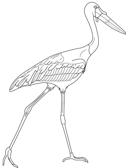
Figure 2. A depiction of the saddle-billed stork.

The saddle-billed stork is a tall and majestic bird that can grow to a height of 150 cm, attaining a wingspan of up to 270 cm. White and black dominate its striking coloration. Its wings are mainly black, tipped with white feathers. The head and neck are completely black and feature a large, pointed bill, which is mainly red with a black band. A yellow frontal shield (called the “saddle”) at the upper end of the bill represents one of the most characteristic features of this bird. At the base of the lower mandible, where it meets the neck, the saddle-billed stork has the diagnostic small yellow wattle. All these characteristics (together with its specific posture and long legs) are usually present in its ancient Egyptian representations, and thus the saddle-billed stork can usually be easily recognized among other bird-signs. The bird is, however, depicted with varying accuracy in different historical periods (Keimer 1930; Janák 2011). These non-migratory birds prefer to breed in marshes and