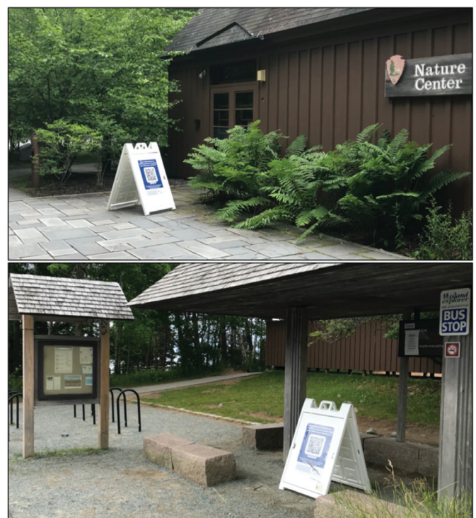
FIGURE 2. Examples of sign placement at ACAD.

QR codes are a class of matrix-based barcodes that may be scanned using the camera app on most smartphones, thereby allowing individuals to access linked websites (Lorenzi et al. 2014). NPS frequently uses QR codes to reach visitors (Cramer 2011; Lorenzi et al. 2014), and in recent years, QR codes have been used to distribute surveys to travelers (e.g., Begoña et al. 2015; Brownlee et al. 2020; Monzon et al. 2020). Previous surveying applications reveal a number of strengths and weaknesses. Notable strengths include the codes’ ability to distribute surveys in a cost-effective (Monzon et al. 2020) and timely (Lorenzi et al. 2014) manner, even in remote areas (Brownlee et al. 2020). Weaknesses include relatively low response rates and the possibility of significant non-response bias resulting from the requirement of technical skills to participate, and from