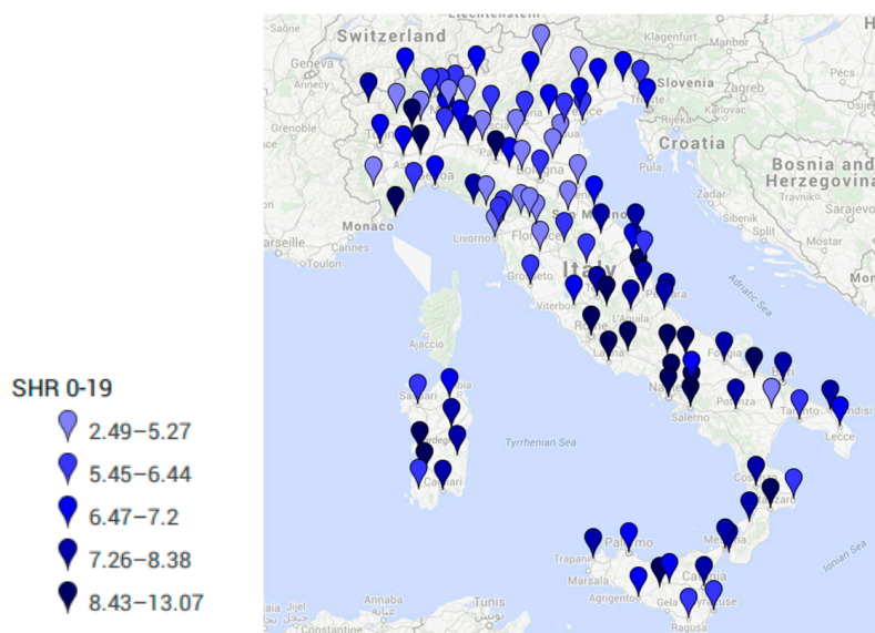
Figure 2. Standardized Hospitalization Rate (SHR) per 100,000 per each Italian province due to main diagnosis of cancer diagnosis of (all tumors) in pediatric population (0–19 years old).

Women always presented SHR values higher than men (data not presented). Figures 2 and 3 show on a map the average annual value of standardized hospitalization rate (SHR) per 100,000 inhabitants per province in pediatric population aged 0–19 and in young adults 20–49 due to all cancers.