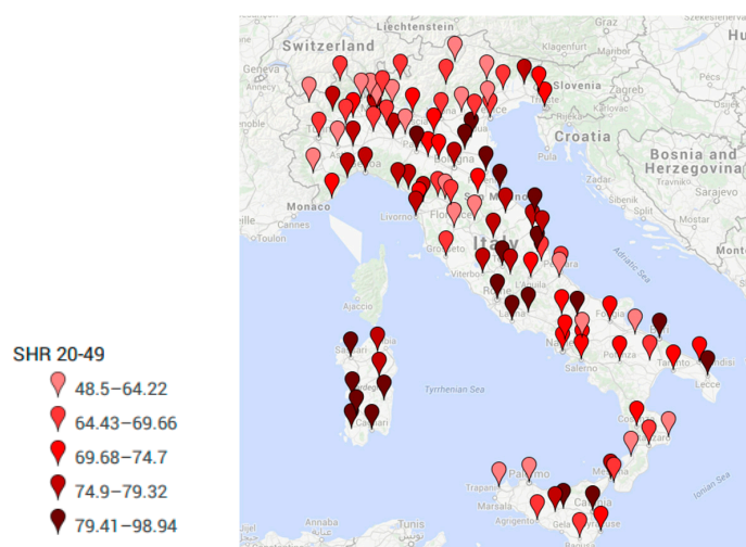
Figure 3. Standardized Hospitalization Rate (SHR) per 100,000 inhabitants per each Italian province due to main diagnosis of cancer (all tumors) in adults aged 20–49 years old.