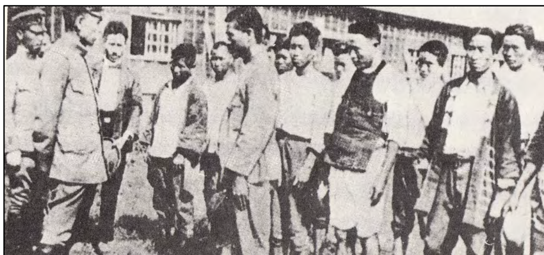
Figure 2. Korean residents in Japan sheltered at Narashino refugee camp during the Great Kanto Earthquake in 1923.