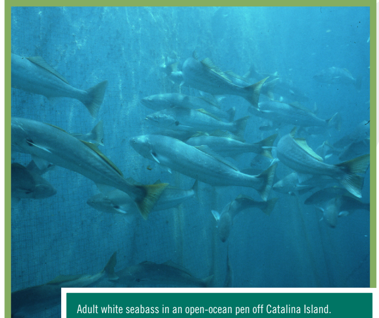
Adult white seabass in an open-ocean pen off Catalina Island.

and commercial fish in Southern California) was selected for the study, as it is spawned and reared for stocking at an experimental, research-oriented hatchery in northern San Diego County, operated by Hubbs-SeaWorld Research Institute. The new tool, though specific to the herpes virus, can be viewed as a “how-to” approach for detecting and monitoring a wide range of microbial pathogens that may or may not be common in the wild.