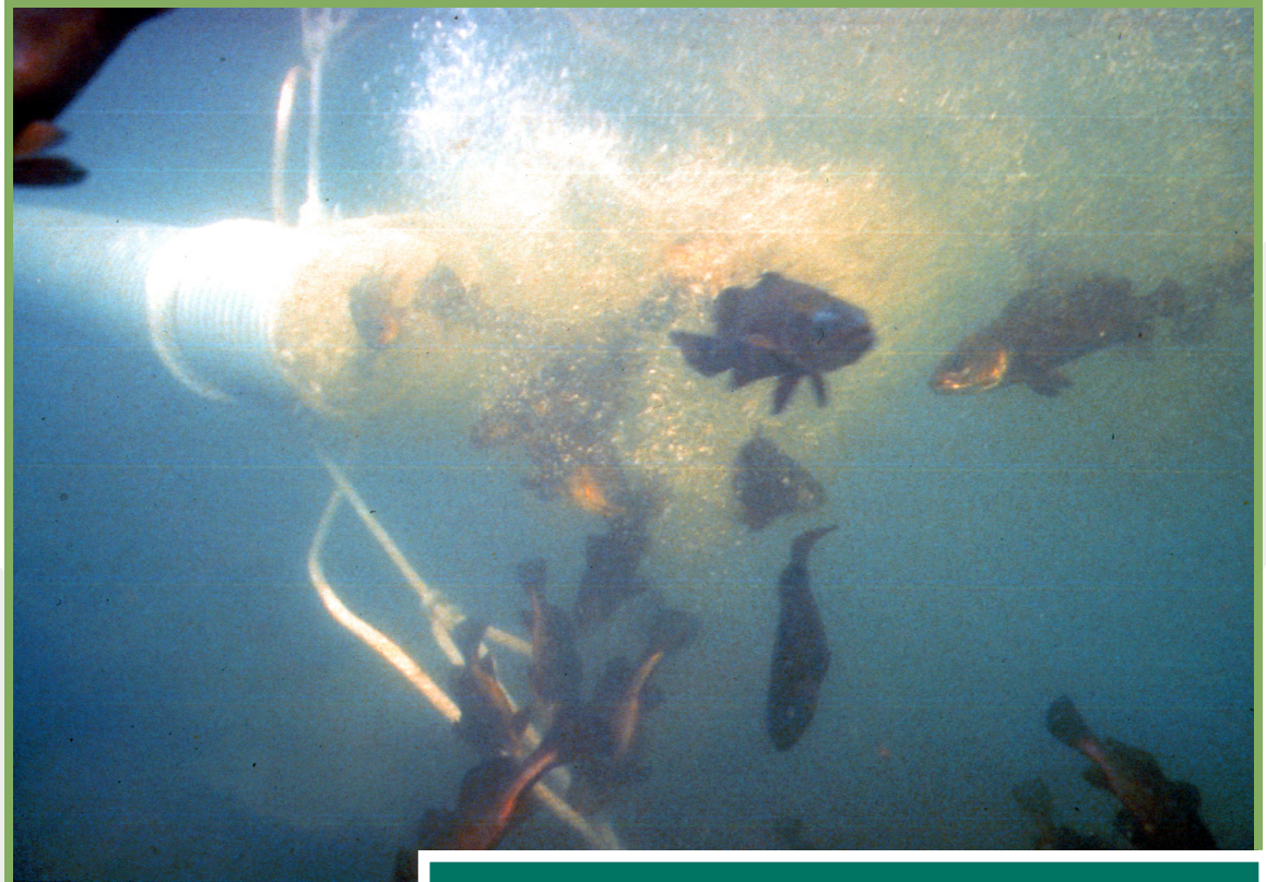
Juvenile, cultured white seabass are released into Mission Bay in San Diego for stock enhancement.

Results of this project have been shared with the California Department of Fish and Game, which oversees the enhancement program, and the Hubbs-SeaWorld Research Institute, which rears and releases the white seabass on behalf of the state.