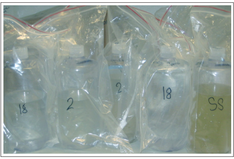
Bottles of water from different sampling sites in the Bay-Delta. No. 2 was collected in the Sacramento River; No. 18, near the Golden Gate Bridge and "SS" from Suisun Slough.