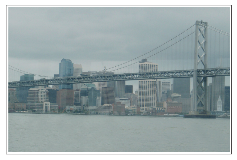
Antifouling boat coatings, contaminated sediments and some herbicides are among the continuous sources of dissolved copper in the San Francisco Bay-Delta.

The goal of this project was to use state-of-the-art analytical techniques to map dissolved copper and copper-binding ligand concentrations at sites in the San Francisco Bay, Suisun Bay, Suisun Slough, Carquinez Strait, the Sacramento River and San Joaquin River. The Delta Science Fellow also characterized the relative contributions of the Sacramento River, San Joaquin River and Suisun Slough as ligand sources.