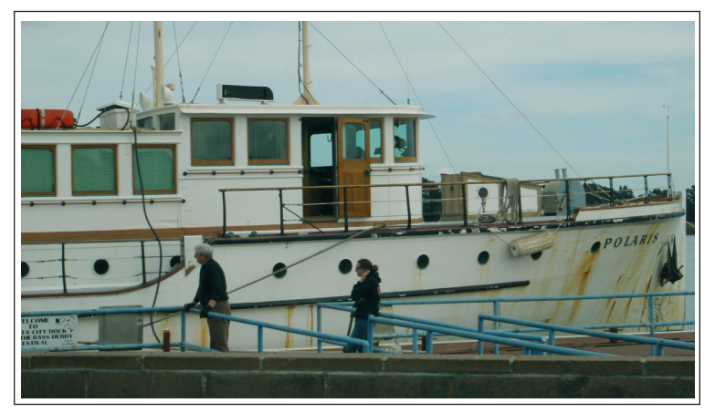
Originally a privately owned yacht, the US Geological Survey purchased the Polaris in 1966, retrofitting its upper salon into a laboratory. Each month, it completes several cruises on San Francisco Bay for water quality and sediment monitoring. Water samples for this Delta Science Fellowship project were collected during these cruises.

Findings from this project complement ongoing research by the US Geological Survey and others to characterize copper bioaccumulation from distinct sources in bivalves and other invertebrates in the region.