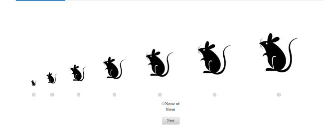
Figure 1: Sample trial slide, showing mice in ascending order, accompanied by the question "Which mice do you find big?"

Materials and Design Each trial of the experiment consisted of a slide containing seven cartoon images of the same object, each scaled to a different size. The images were arranged by size, in either ascending or descending order. They ranged from 38 to 265 pixels in width, increasing by 38 pixels from image to image (Figure 1). Since the experiment was conducted using MTurk, the actual size of the slides that participants saw varied between participants. The images scaled to fit their displays, but were consistent relative to each other across participants. The images used were identical to those used in Tribushinina (2011) and acquired from that author. There were twelve different images, four of prototypically big objects (elephant, hippo, house, plane), four of prototypically small objects (baby, mouse, chick, gnome), and four of