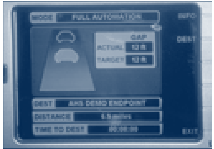
Dashboard display of operating conditions

from the driver's inputs to the steering wheel and pedals. These decisions are being made for reasons largely unrelated to automation. Rather they are associated with reduced energy consumption, simplification of vehicle design, enhanced ease of vehicle assembly, improved ability to adjust performance to match driver preferences, and cost savings compared to traditional direct mechanical control devices.