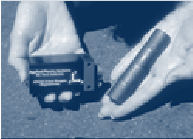
Magnetometer and magnet