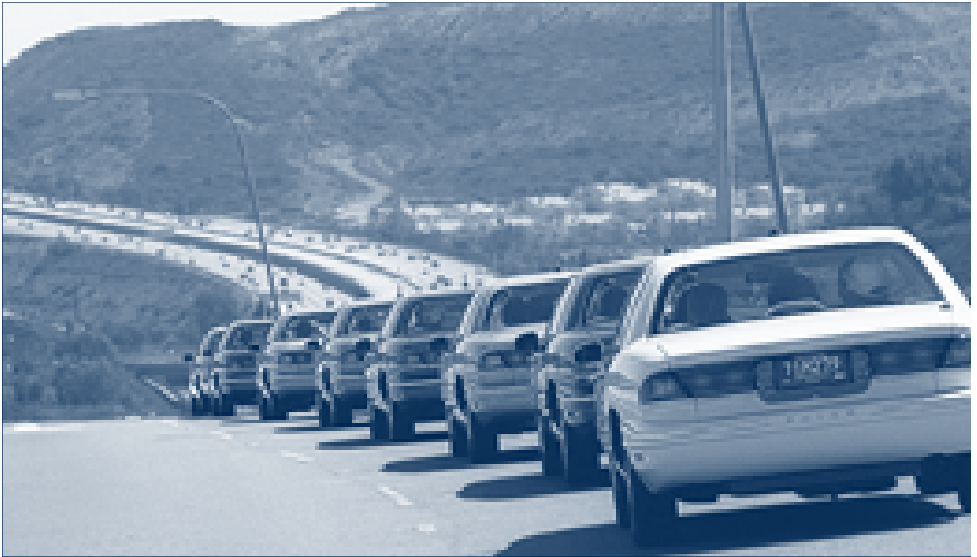
Eight automated cars 20 feet apart at 60 mph

operators, especially with many of the enabling technologies already being commercialized for volume production today.