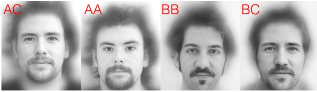
Figure 2. Example of stimuli. AA and BB are faces from the original database while AC and BC are morphs created to function as foils.

were selected from a larger database (Johansson et al., 2005). From these pairs of primary faces (labelled AA and BB in Fig. 2), two more faces were constructed by morphing the AA and BB face with a third face (CC, not shown) unique to each quadruple, resulting in two new faces, AC and BC. Morphs were created using Fantamorph software (Abrosoft Co., 2010).