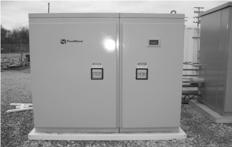
Figure 4. The Static Switch