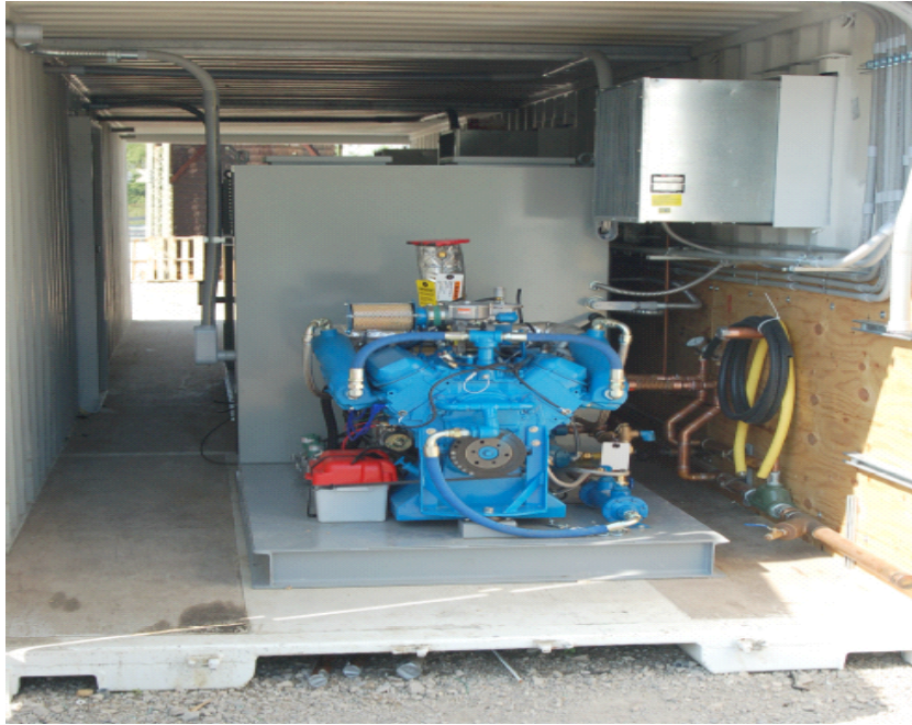
Figure 3. Tecogen Prime Mover with Inverter