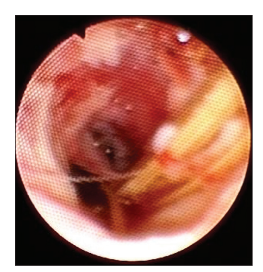
Figure 2. Mandibular salivary duct showing severe erythematous mucosa and fibrin accumulation. Plant material can also be seen.

the awns was unsuccessful. The endoscope was inserted into the draining tract and approximately 15 to 20 grass awns were removed via the draining tract using endoscopic biopsy forceps. After 2.5 h multiple plants awns were still visible in the duct but significant hyperemia and inflammation developed resulting in discontinuation of the procedure. Dexamethasone SP (VetOne), 0.2 mg/kg BW, IV, was infused into the right salivary duct to reduce inflammation and the horse was discharged on the same medications as described previously. Sialoendoscopy was performed a week later and additional plant awns were removed from the salivary duct until none were visualized. Re-examination was performed 2 wk later confirming resolution of the draining tract and a patent salivary duct. At this time all medications were discontinued and the owner was advised to continue to restrict the horse's diet to pellets and eliminate pasture access to reduce the risk of hay or plant awn intake. Six months following discharge the horse was reported to be clinically normal with no draining tract present.