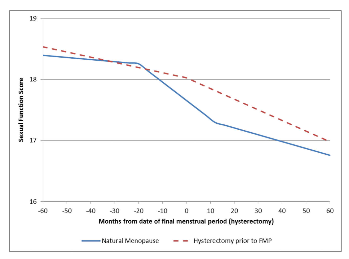
Figure 2. Model-predicted mean trajectories of sexual function over the menopausal transition.