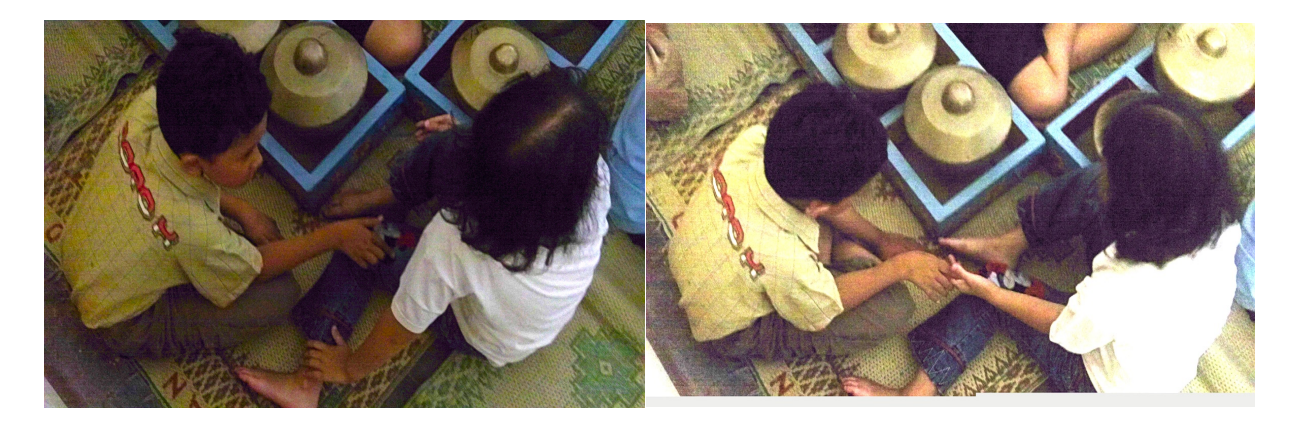
Figure 6.6 Gamelan Rehearsal: Moments of Connection Even those students who do not participate in gamelan rehearsal as musicians enjoy the festive atmosphere of being together in the music room, and socialize nonverbally.