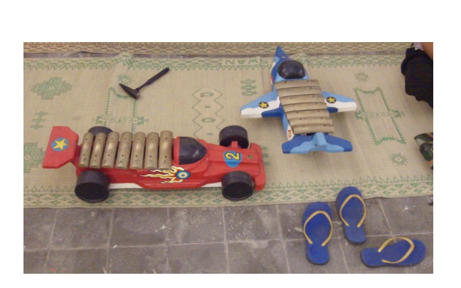
6.1 Smaller scale instruments are more appealing and accessible to young players.