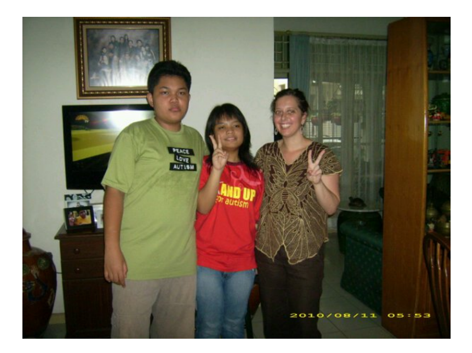
Figure 4.1 Creating "Figured Worlds" of Autism Awareness Simple strategies such as creating "shared artifacts" of autism T-shirts turn everyday space into new experimental spaces of "disability culture." Here, in Jakarta, a young man with autism poses, his shirt proclaiming, "Peace-Love-Autism."