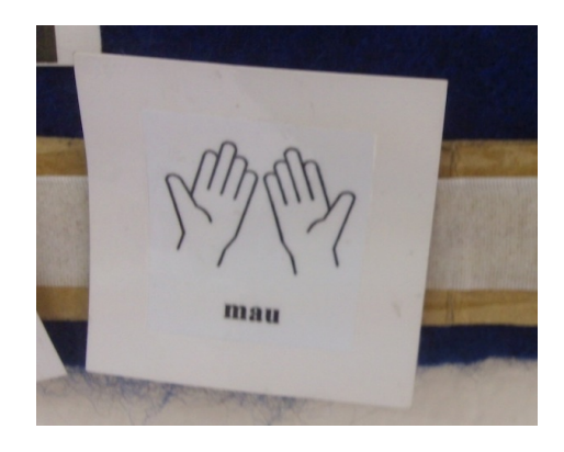
Figure 2.3 PECS in Indonesian . PECS, or Picture Exchange Communication System allows non-verbal people with autism to use images/printed words to state their wants and needs. These cards can be arranged on a Velcro board to make sentences. At Sekolah Mandiga, teachers have worked to create sets of picture cards used in PECS using Indonesian instead of English. Here is "mau" or Indonesian for "want."