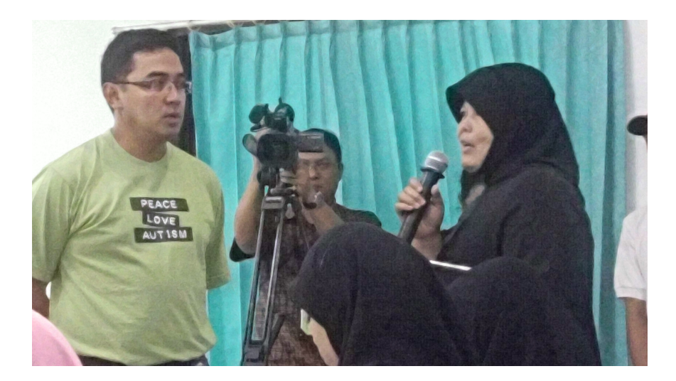
Figure 4.2 Question and Answer Sesion at Autism Workshop

Once again, halfway across Java in the city of Solo, the "Peace-Love-Autism" shirt makes an appearance. Here, a mother takes the microphone during a Q & A session to ask a question about her child's autism. Farhan, a celebrity MC with an autistic child and an autism awareness advocate, moderates the session and shares his own experience.