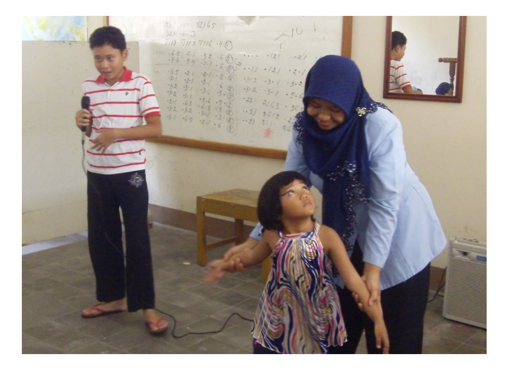
Figure 6.7 Creating Meaning through Shared Movement As Arka sings and the other children play gamelan, a teacher creates an opportunity for interaction and helps shape a classmate's movement into socially meaningful dancing.

Figure 6.6 Gamelan Rehearsal: Moments of Connection Even those students who do not participate in gamelan rehearsal as musicians enjoy the festive atmosphere of being together in the music room, and socialize nonverbally.