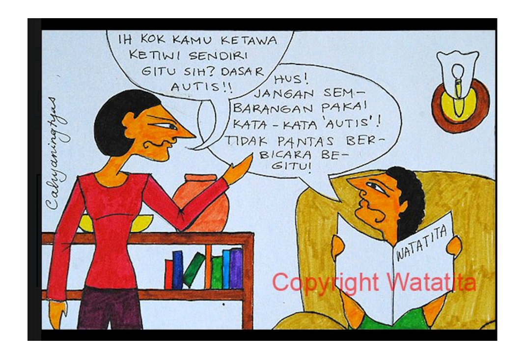
Figure 2.6 Autism in Folk Speech/Slang A comic drawn in a style evocative of traditional Javanese wayang shadow puppet characters intended to dissuade the vernacular use of autism as a slang word or derogatory term. The character in the red shirt says, "What are you doing just laughing to yourself about nothing? That's so autistic!" The character reading the newspaper responds, "Hush! Don't use the word 'autistic' so thoughtlessly like that. It's not appropriate to talk that way!"