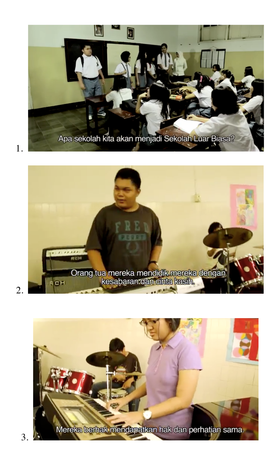
Figure 7.1 Film Stills from I Am Star Groundbreaking and forthcoming new film uses actors with autism to tell a story about inclusion and equal rights. In still one, typical students reject their autistic peers and wonder whether inclusion will turn their school into a "special" school. In stills two and three, the voice-over of a young advocate reminds her friends that autistic people's "parents raised them with patience and love" and thus "they deserve equal rights and attention."