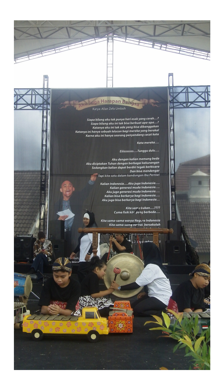
Figure 6.10 Taking the Stage to Advocate for Equal Rights: "I too, am the hope of the nation" Arka pauses before playing underneath the banner displaying the poem by activist student claiming equal rights for those with disabilities.