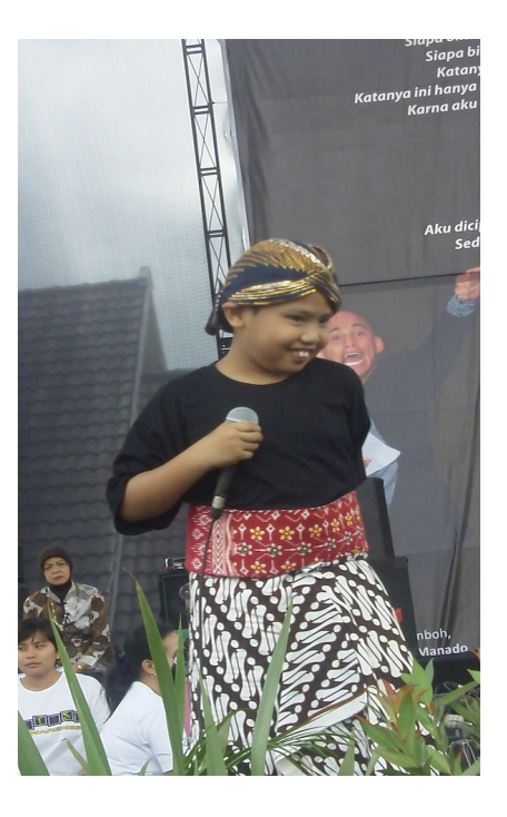
Figure 6.8 Students Take Pleasure and Pride in Gamelan Performance Using non-verbal expression to determine children's evaluations of performance; the smile says a lot!