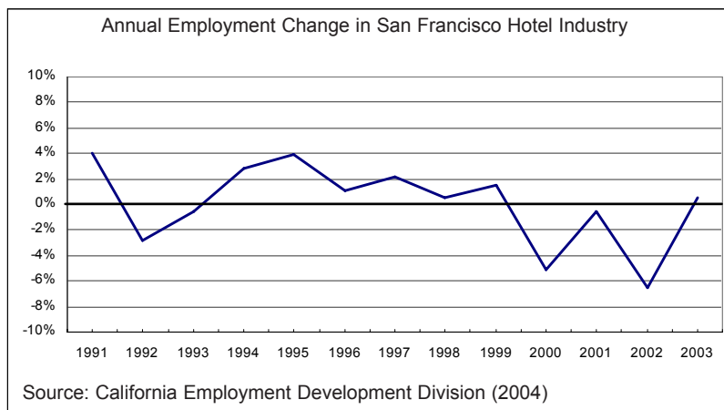
Chart 1: Employment Trends in the San Francisco Hotel Industry

ment levels during the past five years. According to data from the California Employment Development Department, from 1999 through 2003 the industry shed around 2,200 jobs—or about 9 percent of all workers employed at the start of that period. These job losses occurred in two phases: one in 2000, when annual employment figures showed a 5 percent drop from the previous year; and the second in 2002, when employment dropped another 6 percent over the preceding year.