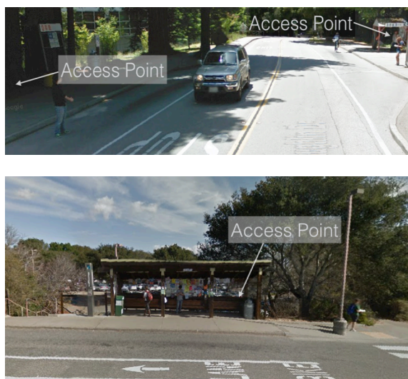
Fig. 2. Top: Science Hill – East (left) and Science Hill – West (right) bus stops. Bottom: East Remote Parking – West bus stop.

Three bus stops in our University campus and one bus vehicle were instrumented with APs. Fig. 2 shows the locations of the bus stops in the campus where APs were placed. Specifically, we instrumented two bus stops (“Science Hill – East” and “Science Hill – West”) facing each other in the upper part of campus, as well as one bus stop (“East Remote Parking – West”) in the lower part of campus (see Fig. 3). The reason for instrumenting two bus stops facing each other is that a user located at one bus stop would be in