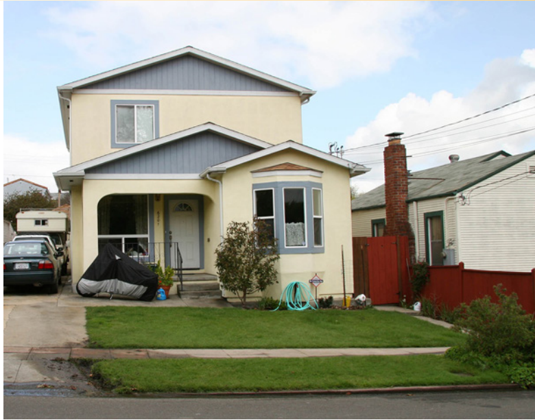
Figure 5. Home garden in Richmond, California, before removing the lawn and planting a bee habitat garden.