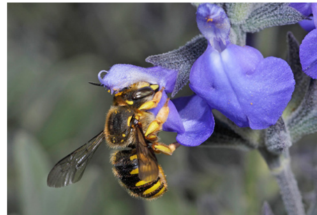
Figure 15. Anthidium manicatum foraging on germander sage ( Salvia chamaedryoides ).