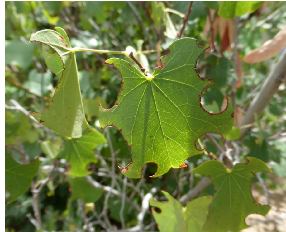
Figure 4. Evidence of leaf-cutter bees using redbud leaves for nest construction.

12. Provide nesting materials. Bees may also need materials to build their nests with, like mud, plant leaves, and resins. Unlike honey bees, native bees don't require a source for drinking water. They may use a water source, however, to make mud for nest construction; such is the case with many mason bee species ( Osmia spp.). To provide water for honey bees and for bees making mud, put up a shallow birdbath and add exposed rocks or floating cork for bees to land on so they don't drown. Circular holes in the leaves of roses and redbuds (figure 4) indicate the presence of leaf-cutter bees ( Megachile spp.), which use the leaf cuttings to line and seal the inside of their nests. A leaf-cutter bee nest, if dug up or seen inside a cavity, looks like a green, leafy cigar!