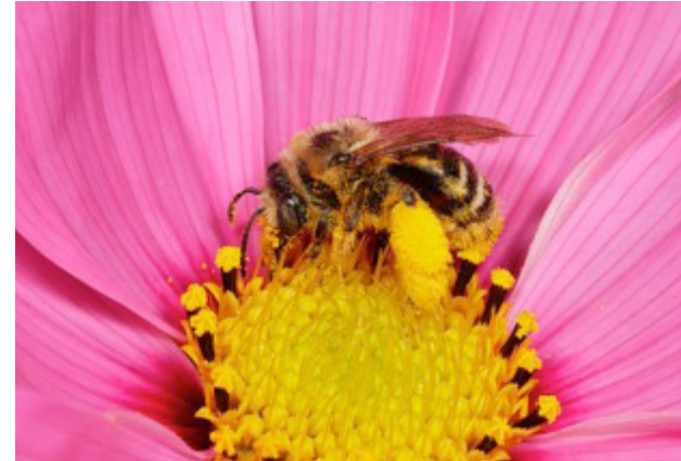
Figure 14. A female Melissodes robustior collecting nectar and pollen from garden cosmos ( Cosmos bipinnatus ).