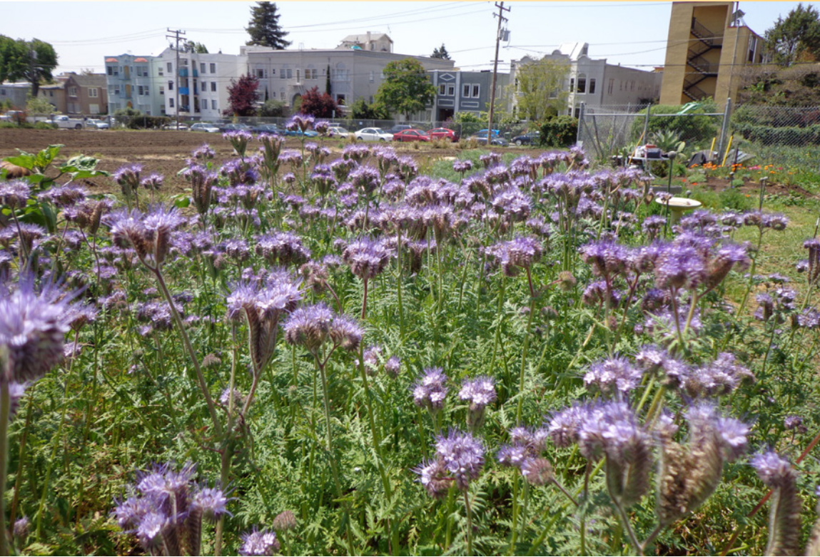
Figure 3. A large patch of Phacelia tanacetifolia at the Oxford Tract Bee Flower Evaluation Garden (Berkeley) in spring 2013.

fall in order to take advantage of the winter rains. In cool-summer climates, they can also be planted in February and March. Summer-blooming annuals like cosmos ( Cosmos bipinnatus , C. sulphureus ) and sunflowers ( Helianthus annuus ) can be planted when the danger of frost has passed in April or May. Lightly scratch the surface of the soil with a rake or fingers, then sprinkle the seeds on generously. Next, sprinkle a layer of soil on top of the seeds to keep them from blowing away or washing away when watering. Water gently and keep the seeded ground consistently moist. Most annuals benefit from the addition of compost before planting and will, as a result of this, reward the bees with a longer blooming season. Allow annuals to drop their seeds after flowering is finished to encourage reseeding for the following year. Transplants can be more convenient and can be planted in the same seasons as the seeds. Many hard-to-find annual native plant seedlings can be mail ordered or purchased at selected nurseries.