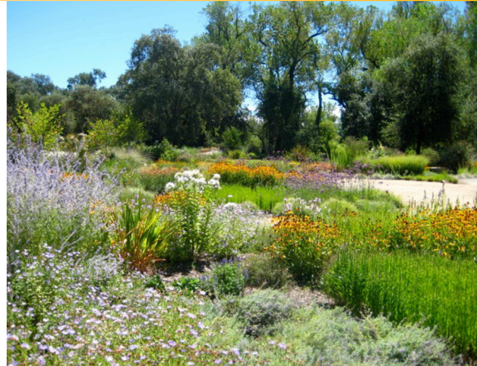
Figure 8. Turtle Bay's McConnell Arboretum and Botanic Gardens (Redding) in late summer 2009.