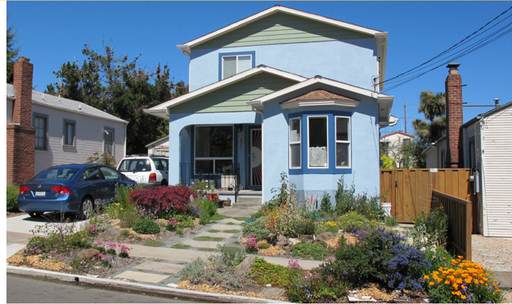
Figure 6. Same home garden, 3 years after bee-attracting plants have begun to mature, bloom, and attract bees.

Fall, with its cooler temperatures, shorter days, and imminent rainfall, is the best time to plant a bee garden in California. Much of the plants' growth at this time will be in the roots rather than vegetative growth, and that gives the new plants an advantage when temperatures warm up and the soil dries in spring. Fall and winter are usually the wet seasons in California, and a bee garden will benefit from the natural pattern of rainfall that helps plants get established.