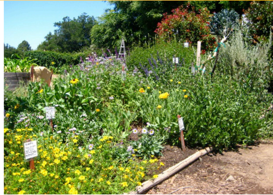
Figure 9. The Emerson Park Community Garden (San Luis Obispo) native bee plot in summer 2009.