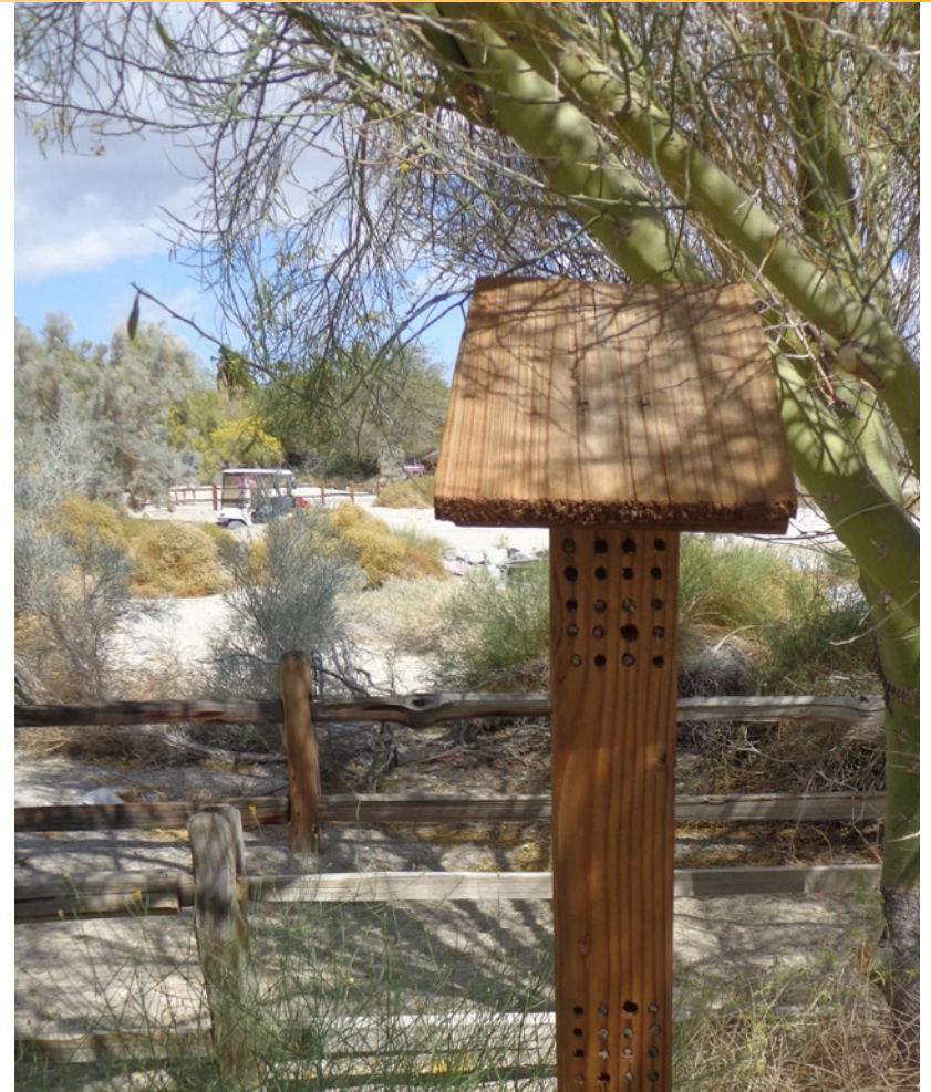
Figure 2. A native bee condo at the Living Desert, Palm Desert, California.

The female solitary bee builds an individual nest by digging a tunnel in the ground or selecting a pre-existing cavity such as those made by boring moth and beetle larvae. The young will develop in the nest for several months before they emerge as adults the following year. Approximately 70% of native bees nest in the ground and 15 to 20% nest in crevices and cavities. The remainder are “cuckoo” bees, meaning that, like the cuckoo bird, they do not have nests of their own. Instead, they take over the nests and collected resources of other bees, co-opting them for use by their own young. You can make an inviting “bee condo” for cavity-nesting bees by drilling holes in untreated wood or bundling paper straws together (figure 2).