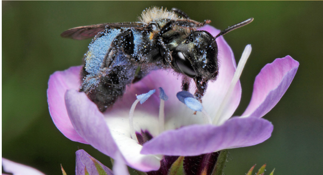
Figure 11. Andrena nigrocaerulea foraging on spring flowering bird's-eyes ( Gilia tricolor ).