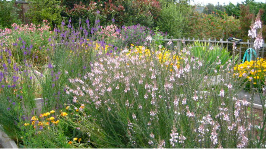
Figure 10. Large patch of toadflax ( Linaria purpurea ) of 2 cultivars, with both purple and white flowers.