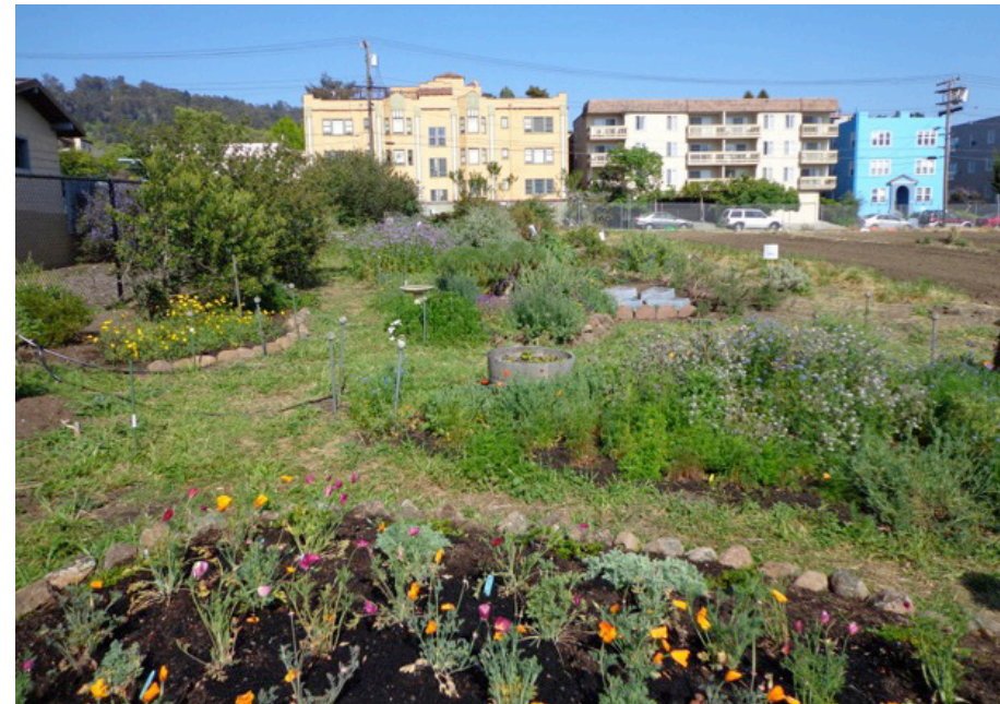
Figure 1. The Oxford Tract Bee Flower Evaluation Garden (Berkeley) in spring of 2013.

These diverse gardens across the state have shown that, given the right selection and composition of plants, bees will visit. During this survey work, researchers identified several different types of garden. Some home gardens and arboreta focused on native plants only, while others incorporated both natives and exotics for year-round flowering. Still others integrated bee-friendly plants into edible gardens. The “garden recipes” presented here are inspired by these diverse gardens and are intended to help gardeners choose plant types that will work well in their own garden settings. These recipes build