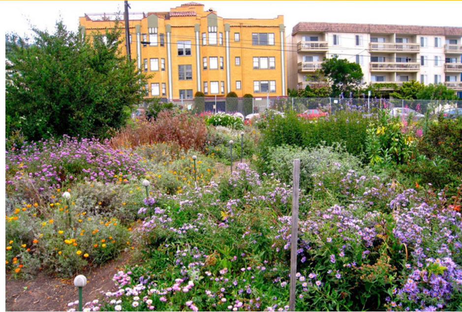
Figure 16. The Oxford Tract Bee Flower Evaluation Garden (Berkeley), full of summer blooms.

Make sure to take notes of your observations so you will be able to compare from year to year the new and different visitors in the garden. Photographing bees can be a challenge and may take some patience, but it is the best way to track bee visitation. You can