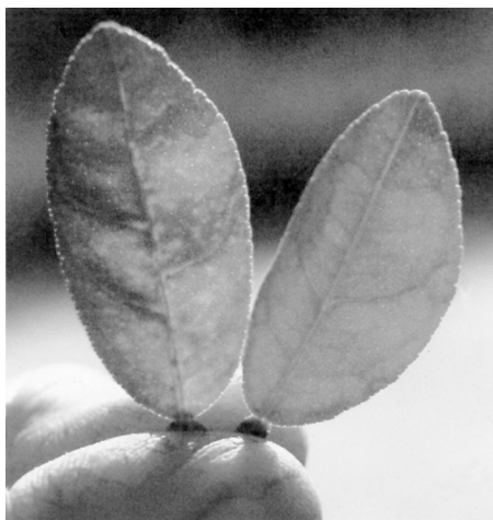
Fig. 2. Symptoms in Mexican lime leaf induced by the citrus tatter leaf virus inoculated into Mexican lime from tatter leaf infected ‘Meyer’ lemon. Control leaf on right.

cut back to produce a second flush of new growth. Inoculated plants were observed for symptoms for 4 to 6 mo after inoculation. Eleven additional experiments, a continuation of the experiment of Roistacher (6), were conducted from January, 1987 through April, 1998, extending the period of testing of the holding plants from 12 to over 22 yr.