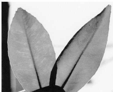
Fig. 3. Mild mottle in the leaf of Dweet tanger inoculated with symptomatic tissue of Mexican lime (Fig. 1). Control leaf on right.

As shown in Fig. 1, the tatter leaf component from Meyer TL-102 transmitted to ML and then to rough lemon as the holding plant was not expressed in the CE indicators until 3.3 to 6 yr. This indicated some form of slow incubation or replication in the rough lemon holding plants. This delayed reaction in the rough lemon holding plants also occurred with two other Meyer lemon source trees: Meyer TL-100 and Meyer TL-101 (6) where delay before symptom expression in CE was 4 and 5 yr respectively. Thus, both the tatter leaf and citrange