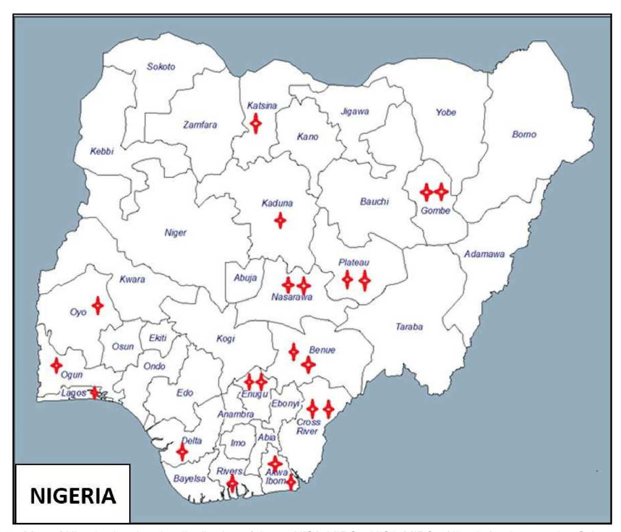
Figure 2 Map of Nigeria showing the distribution of the 21 NISA-MIRCs. NISA-MIRCs, Nigeria Implementation Science Alliance Model Innovation and Research Centres.

that build equitable partnerships with both local and international researchers, institutions and organisations. Having developed these centres, we will embark on cohort development. We are actively applying for multiple research grants from NIH and other funders of biomedical research.