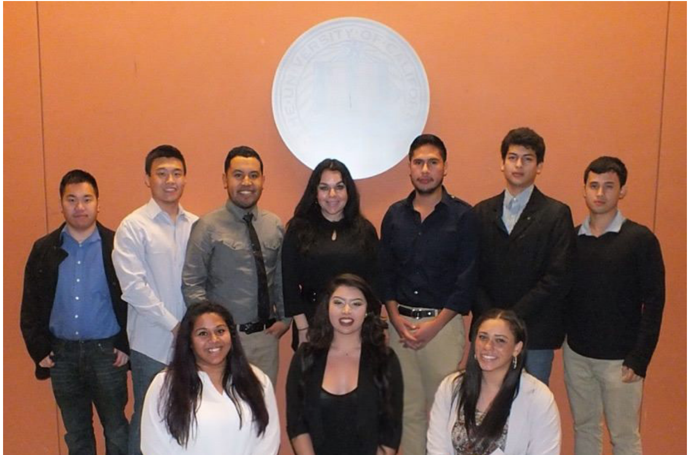
UCMURJ 2015 Spring Team