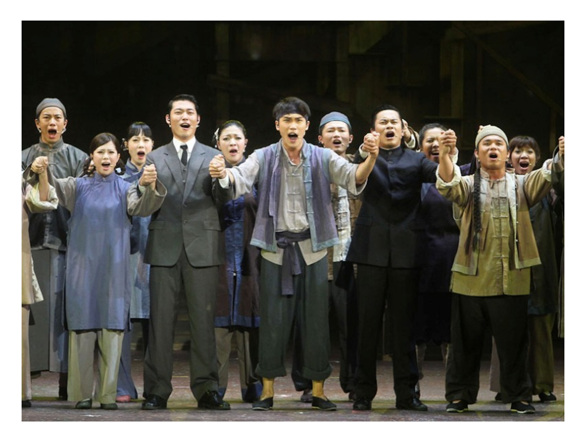
The second story unfold in Dreamers