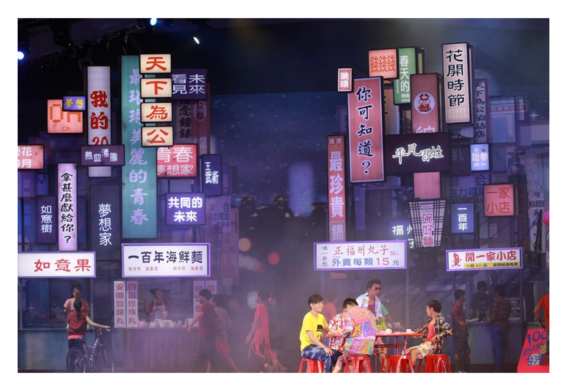
The Stage of Dreamers