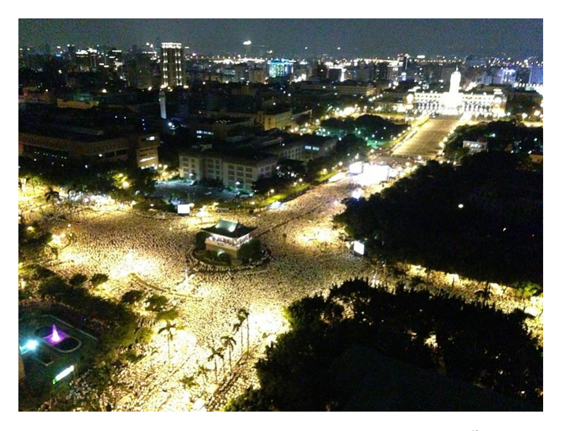
Photo of White Shirt Movement <sup>40</sup>

The white-dressed demonstrators keep gathering at the intersection, rendering the river as if covered by snow. This "heavy snowfall" is where the name of the second demonstration— August Snow—comes from. The name echoes the renowned Taiwanese dialect song August Snow produced by the celebrated Taiwanese composer Chen Ming-Chang. Originally written for the Golden Bough Theater's 2010 musical Sayonara 1945 , August Snow expresses a common shared melancholy toward the broken home and country by describing an uncanny snowfall in August. In the celebrated Chinese play Dou E yuan (竇娥冤), written by Guan Hanqing during the Yuan Dynasty, the innocent woman Dou E, when sent to her execution, swears that her innocence will be proven by the heavy snowfall in June and the thick snow will cover her dead