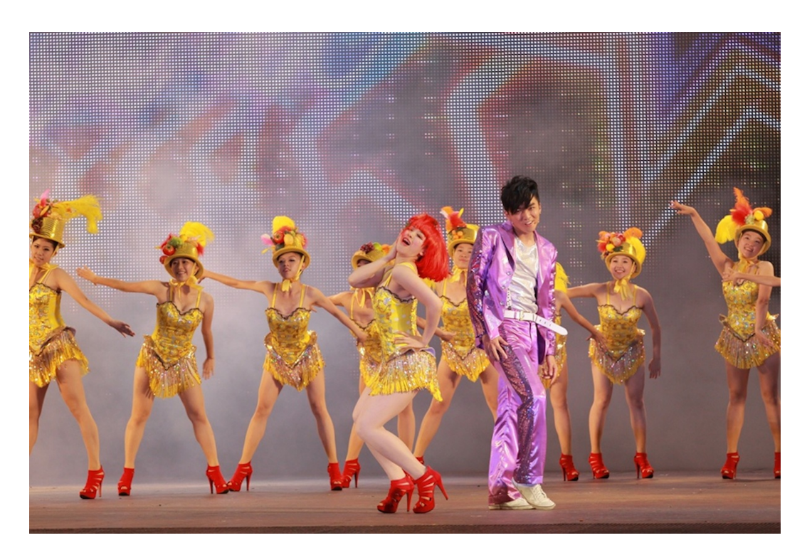
The go-go dancers in Dreamers