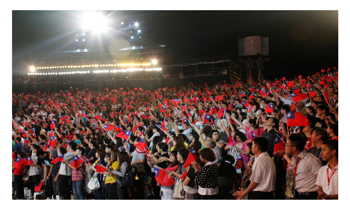
The ROC flags holding in the audiences' hands.