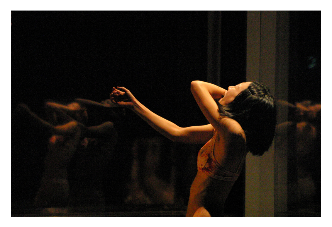
A performer in A Soldier's Pay

ROC military's best excuse to waive investigations by external organizations and, on the other hand, compels the cases rapid conclusions. In this case, it is not surprising that most of these swiftly-concluded cases are still pending and that the national glory is ironically overshadowed by them. In this scene in A Soldier's Pay , the intertwining the woman's national identical monologue with her sufferings of being raped and murdered illuminates the complex relationship between politics and sexuality, revealing how rape has been legitimized to serve the imagined nationality.