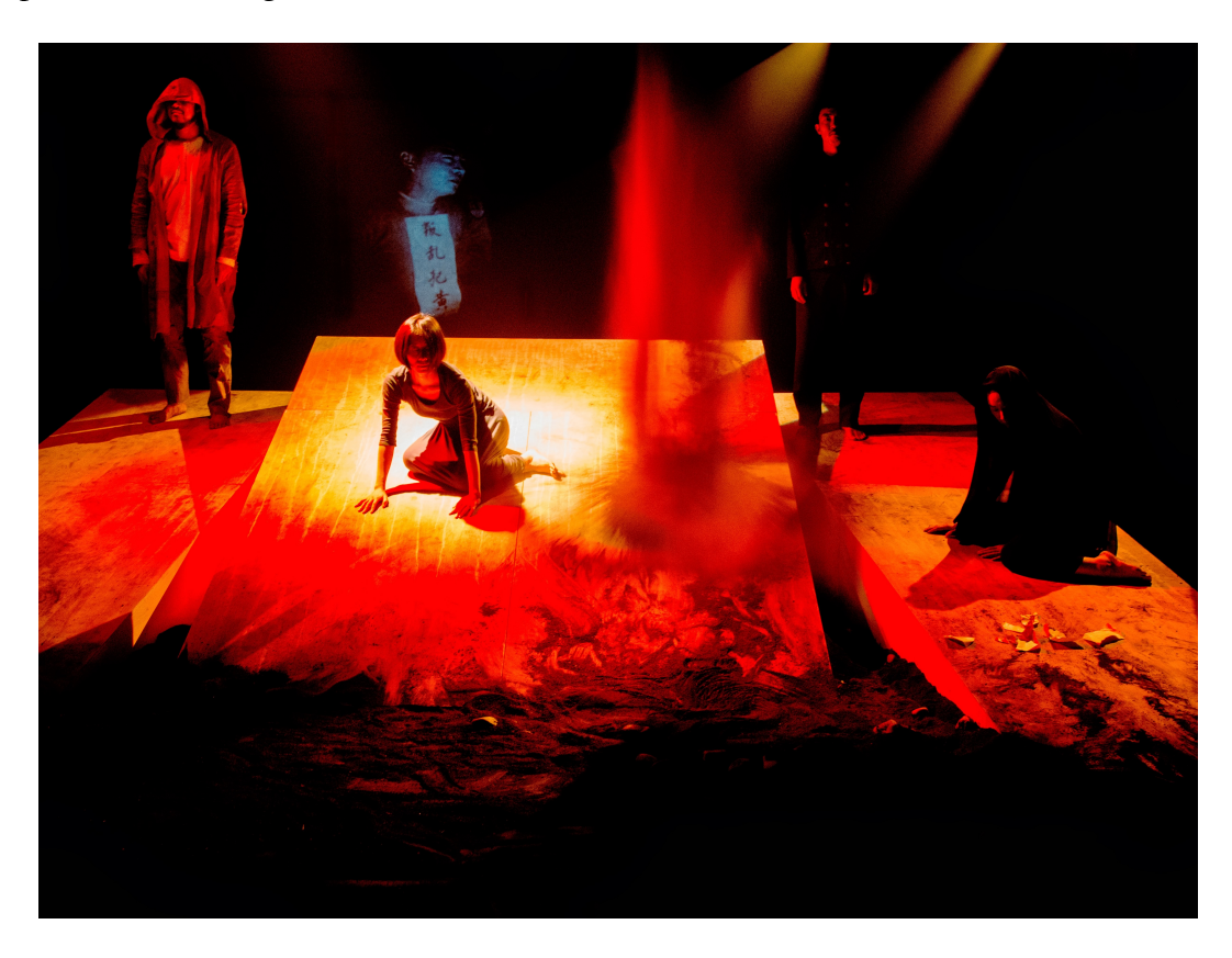
A scene in Antigone (photographed by Hsu Pin)

uncomfortable, as if they might get hurt by the objects rolling down on the rakes. Yet the images of the performers rolling on the rakes from the highest place to the floor like dead bodies falling down produce a thrilling ambience.