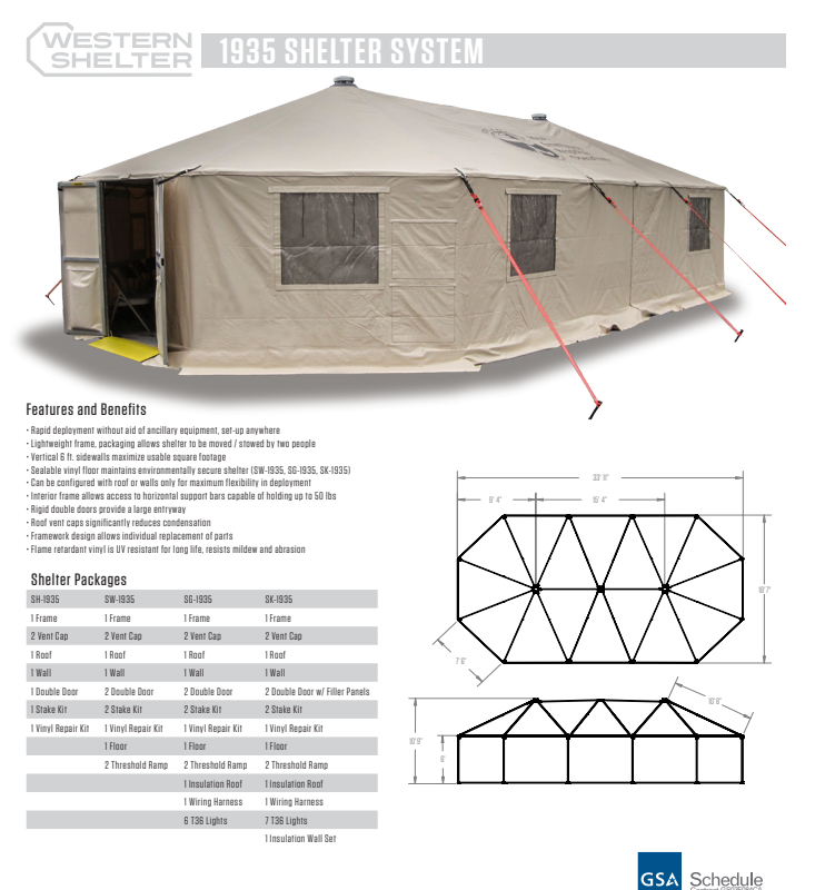
Figure 1. Tent structure schematics for emergency department forward treatment area.

printers; vital sign units for recording full sets of vital signs; and hand hygiene stations (Figure 3).