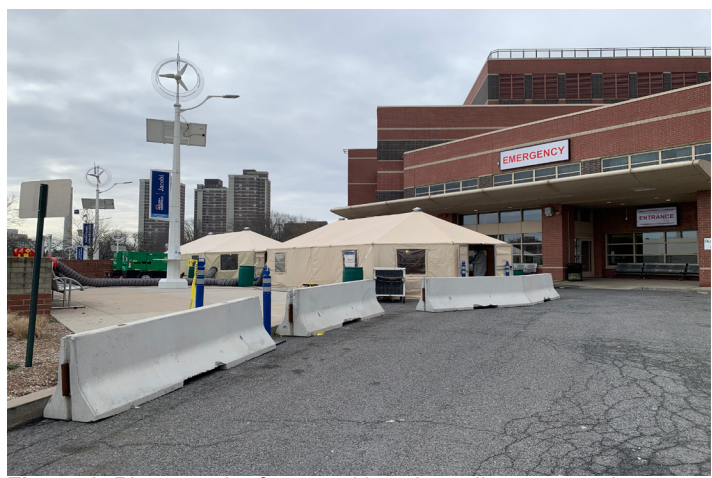
Figure 2. Photograph of tent and location adjacent to main emergency department.

No testing for COVID-19 was done in the FTA, in compliance with the recommendations of the NYC DOH, because testing samples were in extremely short supply at that time.