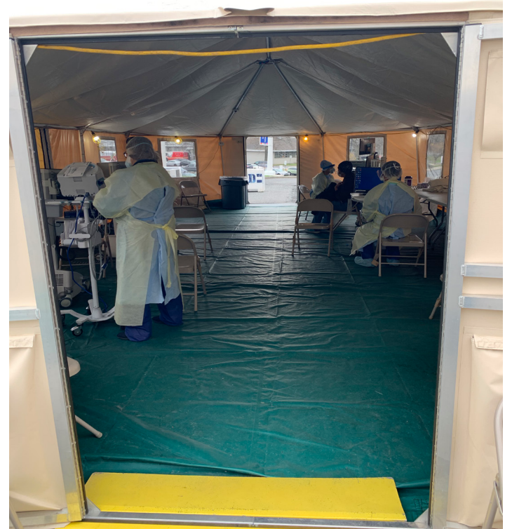
Figure 3. Photograph of inside of tent.

time depending on patient volumes with the EM attending overseeing the processes.