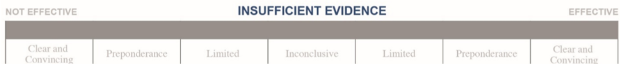
Figure 2. Impact of DRE on Health Outcomes and Utilization of Other Health Services

Summary of findings regarding the impact of DREs on health outcomes and utilization of other health services: There is insufficient evidence that DREs affect health outcomes and subsequent utilization of other health services.