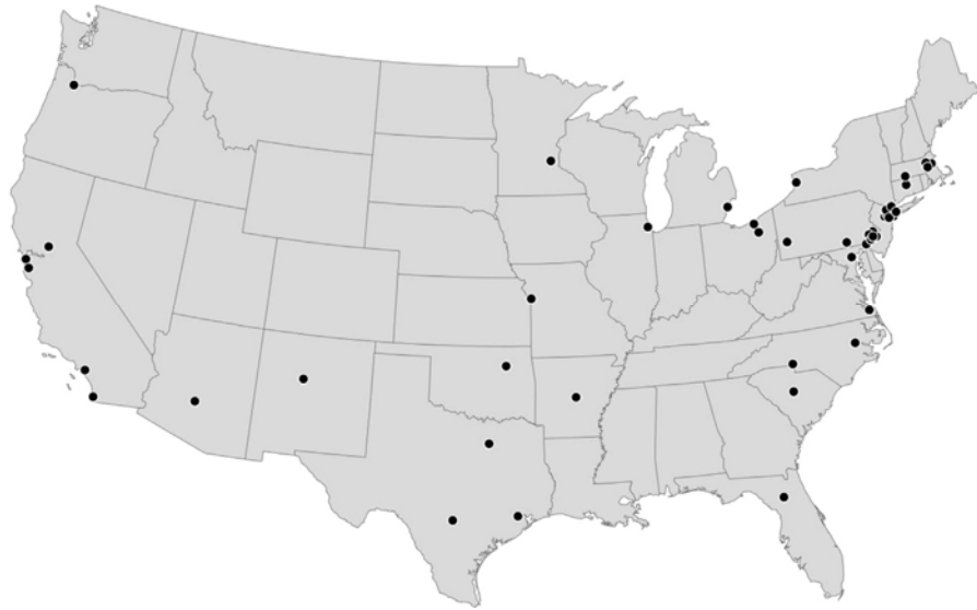
FIGURE E1. Location of the 48 participating sites in the Multicenter Airway Research Collaboration 36 study.