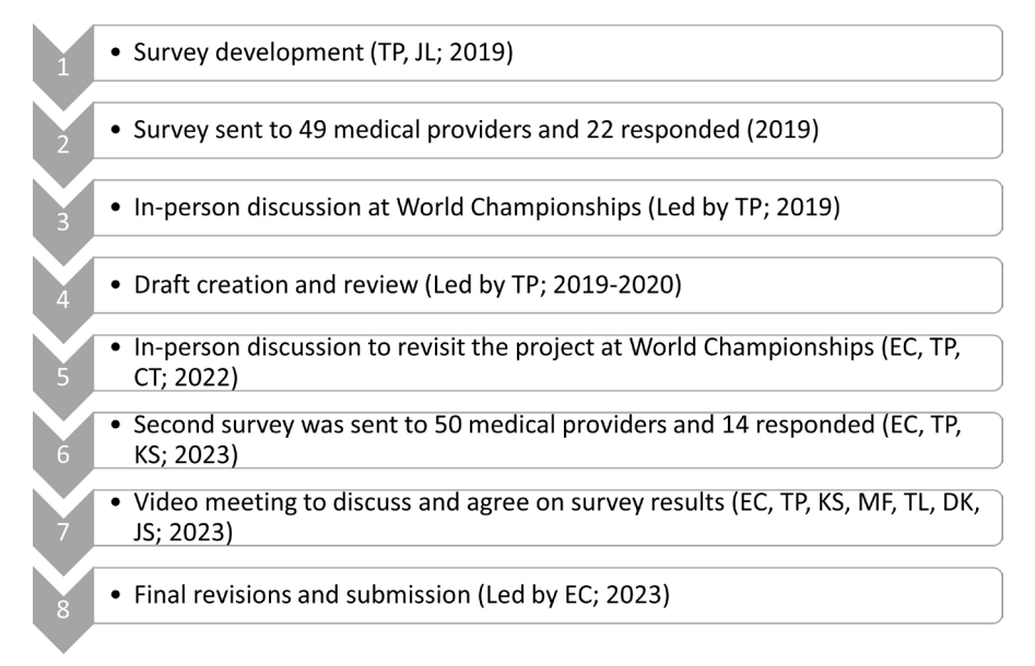
Figure 1 Flow diagram of the process of writing this extension statement.