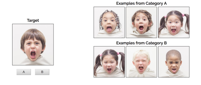
Figure 1: Example of a trial from the task . Participants were shown a target image (left), along with a teaching set of examples from both the target category (angry, bottom right) and the other category (surprise, top right), and asked to predict how the model would respond based on the examples provided. The teaching sets for the target and other categories were sampled from the set of examples that the target model considered to be in each category respectively.

beginning of the experiment. They were presented with instructions indicating that a robot had learned to categorize faces into different categories and that this robot would provide helpful examples to help them understand what the robot had learned. The goal for participants was to predict the robot's choice in categorizing the target images, using the examples provided on each trial to help them out.