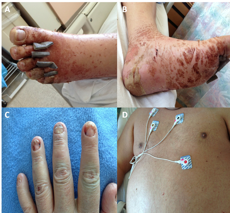
Figure 5 (A and B) Our patient's left foot with residual superficial erythematous rash. (C) Inflammation extending into bilateral hands and involving fingernails. (D) Faint erythematous rash involving the chest, abdomen and trunk.

According to one recent review of 172 DRESS cases, there are 44 drugs associated with DRESS [9]. Of these, the most frequently reported were carbamazepine, allopurinol, sulfasalazine, phenobarbital, lamotrigine and nevirapine.