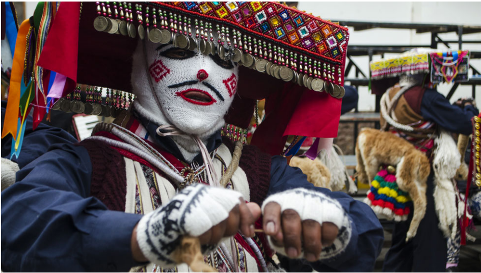
Figure 2. A Qhapaq Qolla dancer performing in the festivity. 2017.

After the meal, Qhapaq Qolla dancers who are considered antiguos —those who have danced for at least four years—gather in a private room within the cargo wasi to conduct a meeting in which they evaluate their performance during the festivity. Dancers call this meeting the t'aqwinakuy . The Qhapaq Qolla who are not antiguos cannot attend. The newest members of the troupe also cannot participate in the t'aqwinakuy . Their job as their peers conduct the meeting is to wash the dishes and clean up the kitchen.