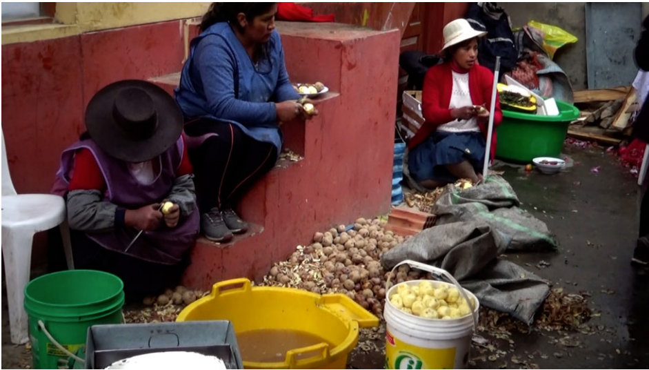
Figure 5. Female cooks working in the Qhapaq Qolla cargo wasi . 2018.