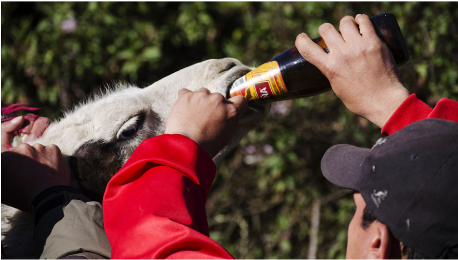
Figure 6. Qhapaq Qolla dancers giving beer to the dance troupe's llama. 2017.

serves an important role in the festivity—is meant to teach new dancers the importance of the labor of the people who work for/with the troupe. Servants are vital to the success of the festivity. While they are not in the spotlight during the celebration, they are as integral to it as the dancers themselves.