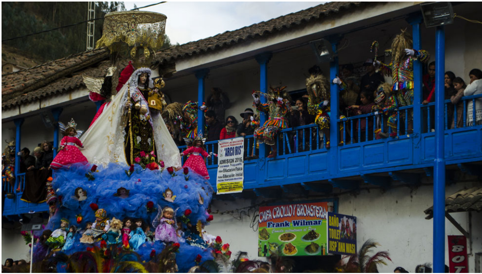
Figure 3. The image of the Virgen del Carmen out in procession during the festivity. 2016.

Qolla and my positionality, as they undoubtedly shape my ideas about the traditions of the troupe. I am Peruvian and was born in Lima. My mother is originally from the Cusco region, where Paucartambo is located, but she is from a town considered Amazonian rather than Andean. 4 Thus, paucartambinos and paucartambinas do not consider either my mom or me Andean. Even when I tell them my mom is from Quincemil, they see that as anecdotal and not an indication that I have strong cusqueño ties.