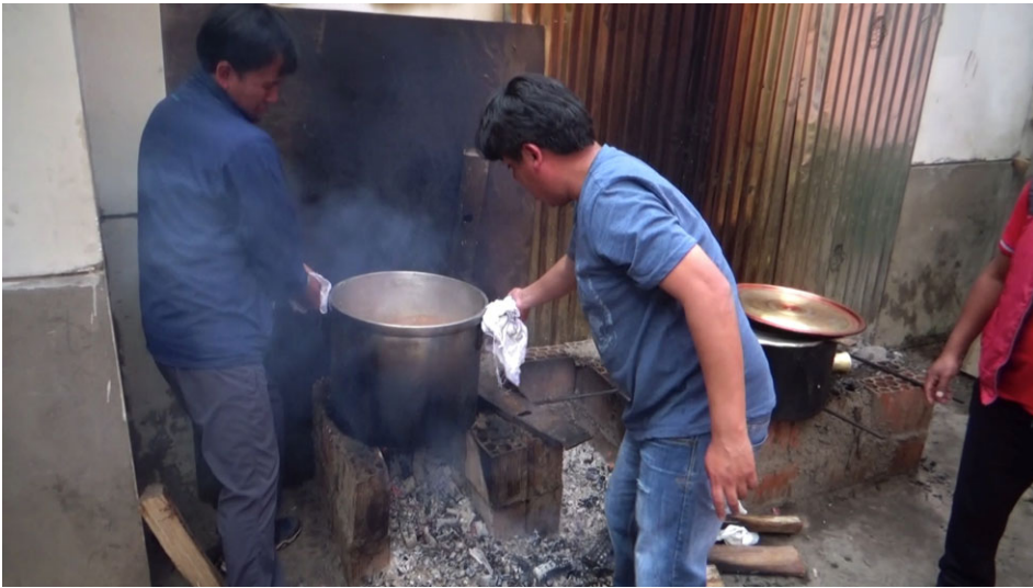
Figure 4. New Qhapaq Qolla dancers cooking lunch. 2018.

jokingly dared their dance mates to have some. When the senior dancers finished eating, the cooks picked up the plates and brought them back to the kitchen.