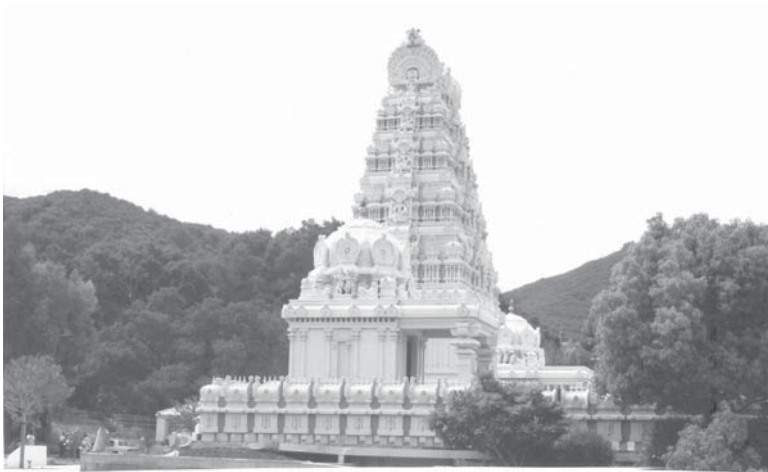
Figure 4 Temple Gopuram, Side View

ancient art of temple architectural design. The temple was designed by the sthāpati from India, but a local Hindu architect in Southern California donated his services in preparing and conforming the plans to local building codes (see also Mazumdar & Mazumdar, 2006; Fenton, 1988).