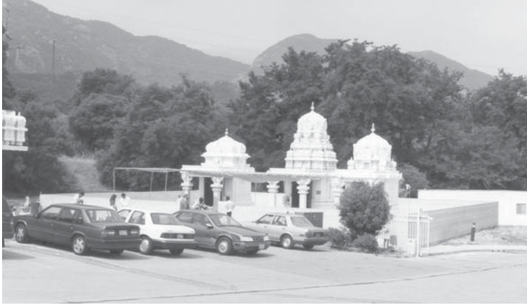
Figure 2 Temple Site Surrounded by the Hills

the ritual process of deity installation. Some devotees were active participants; they carried the kumbhams around the temple and bathed the deity with the sanctified water, a process known as abhisekham , and a few even climbed to the top of the temple sanctuary and poured water from above, whereas the rest of the assembled crowd watched reverentially from below (see also Eck, 2000; Mazumdar & Mazumdar, 2006).