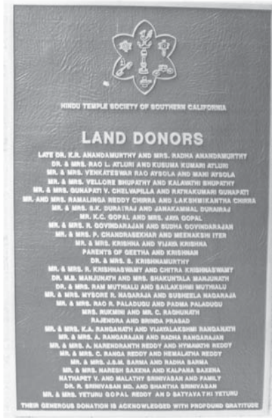
Figure 3 Plaque Acknowledging Land Donors of Hindu Temple Society of Southern California

sacred microcosm that was completely and uniquely in their cultural image (Clothey, 1983). Hindu Americans took “an important step toward community formation. . . . Establishing such a place mark[ed] the beginning of their transformation from the short-term attitudes of temporary sojourners to the long-range expectations of permanent residents” (Fenton, 1988, p. 169).