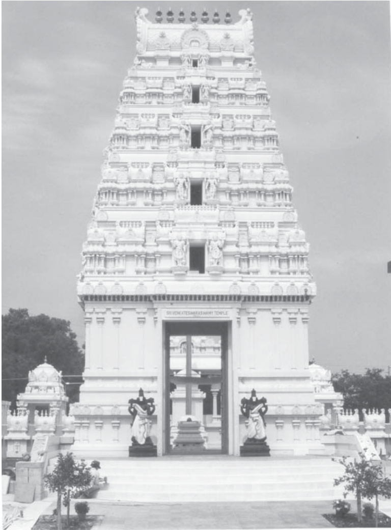
Figure 5 Temple Entry Gopuram

schedules—that did not allow for Hindu observances—and holidays, to enable education and socialization of children, and also to adjust to the changed status of the Hindu religion from a dominant religion in India, with followers