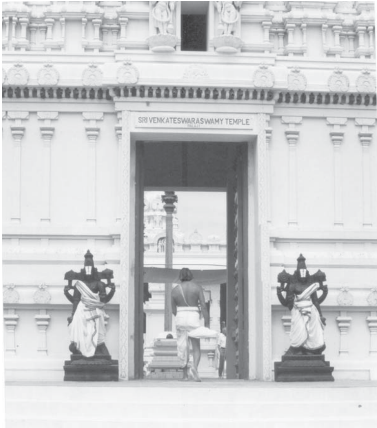
Figure 6 Priest in Temple Entry

constituting the majority, to a minority religion in a predominantly Judeo-Christian society.