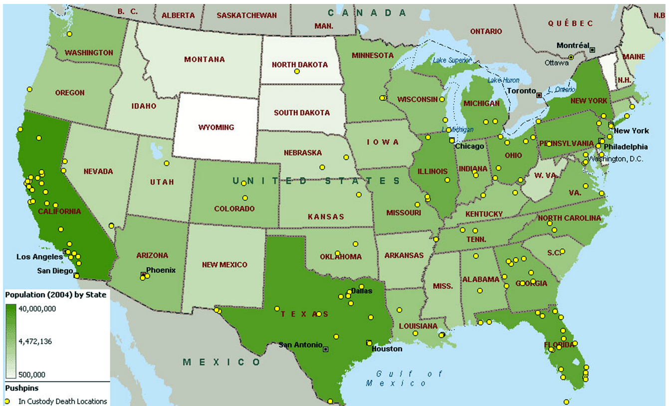
Figure 1. Map of ARD locations during the 12-month surveillance period. Note that many of the mapped points are overlapping, so some map points represent more than one event.

of ARDs primarily due to lack of reporting compliance and the inclusion of all types of death that occurred in custody. Our project primarily examines deaths other than homicide or suicide, namely sudden, unexpected death during custodial arrest from no readily apparent cause.