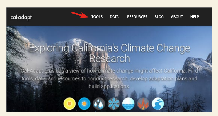
FIG. 1A. Cal-Adapt homepage. Once at the homepage, click on the "TOOLS" tab in the top right.