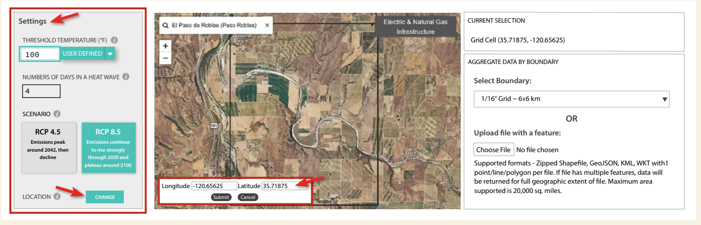
FIG. 1C. Once a specific tool is chosen, the scale of projection can then be selected. Scale options include counties, watersheds and 6 \text{ km} \times 6 \text{ km} plots. A sample 6 km \times 6 km grid projection is shown here.