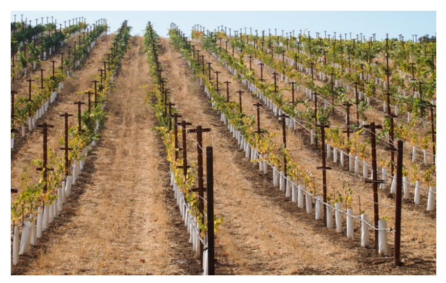
Vineyard redevelopment in the Paso Robles AVA. As vineyards are planted new or redeveloped, long-term adaptations can be introduced, such as changing grape variety, rootstock, vine spacing, row orientation and trellising systems.

I love different varieties. I did my whole masters on that. But no, you're locked in. You're already in an oversupply market. I don't need to create 30 new varieties that no one has ever heard of. They can't even sell the line they have. — VM 6