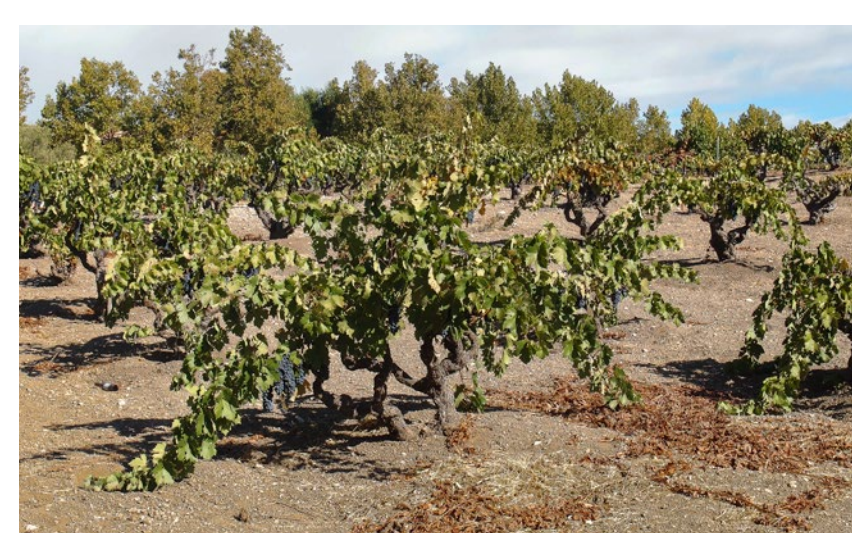
The dry farming of grapes is one potential strategy for conserving water in the critically overdrafted Paso Robles Watershed Subbasin.