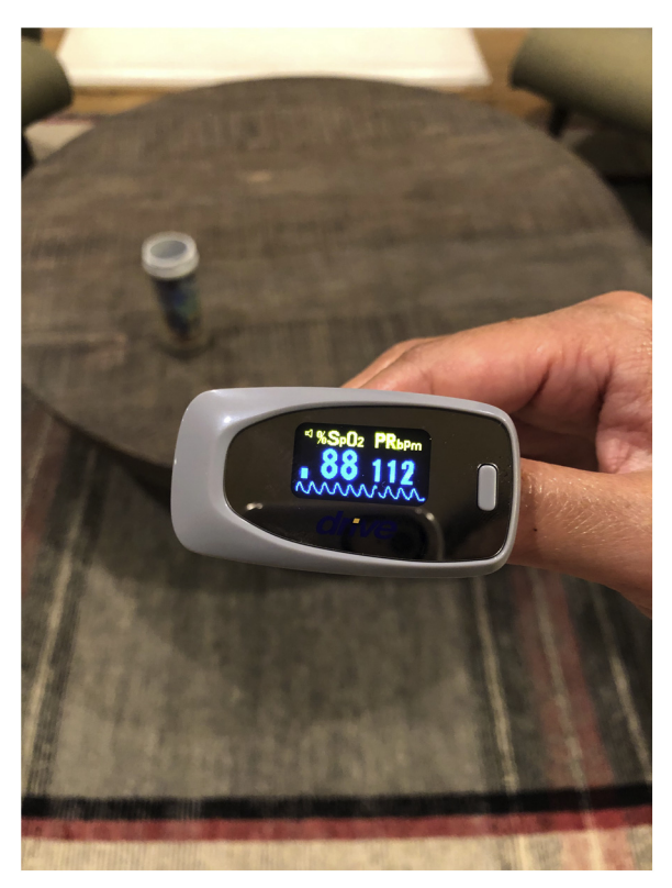
Figure 1. Initial pulse oximeter reading showing tachycardia to 112 beats/min and hypoxia to 88% with patient breathing room air.

A 42-year-old woman with no medical history developed diarrhea, followed by dry cough, severe myalgias, mild exertional dyspnea, and fatigue in March 2020 after a trip to Cancun with a layover in Mexico City. The patient and her husband, both emergency physicians, suspected that she had contracted SARS-CoV-2. They used a thermometer, a borrowed portable pulse oximeter, a portable ultrasound machine, and a home serology test to confirm the diagnosis.