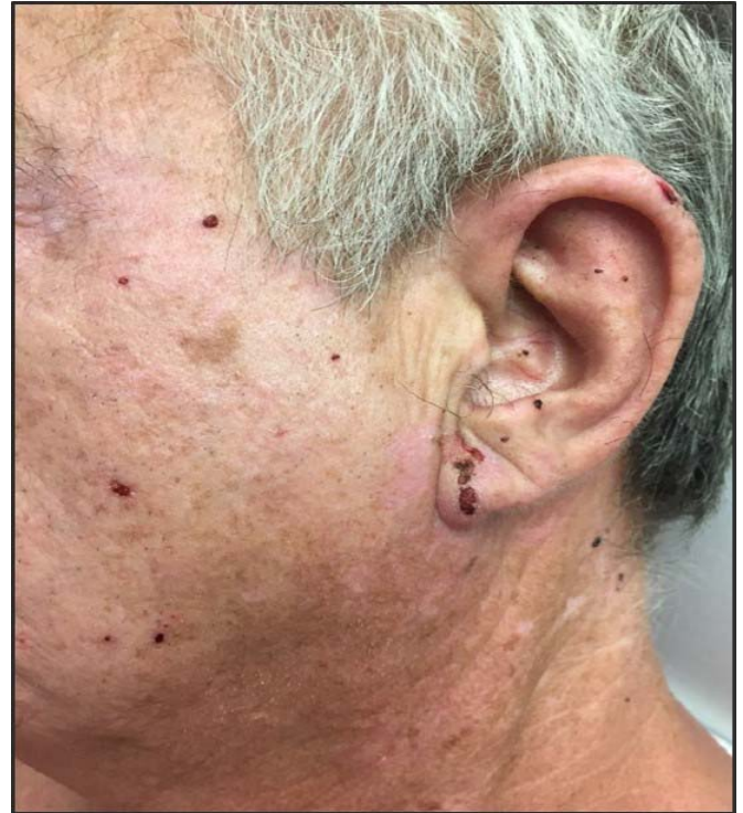
Figure 1. Forehead, lateral cheek, left ear, and left posterolateral neck with scattered superficial erosions, many with heme-crust. Lateral cheek with mild hypertrichosis.

Porphyria cutanea tarda (PCT) is the most common type of porphyria, a disorder of heme synthesis [1]. Enzyme defects along the heme synthesis pathway lead to the buildup of pathway precursors, causing two types of porphyrias: acute hepatic porphyrias and photocutaneous porphyrias [1]. The cutaneous porphyrias have skin involvement related to overproduction of photosensitizing porphyrins [1]. In the case of PCT, uroporphyrinogen decarboxylase is inhibited, leading to a buildup of photosensitizing porphyrins produced by the liver [1, 2]. In nearly all patients with clinical disease, at least two genetic or acquired factors that reduce uroporphyrinogen decarboxylase activity, and thus increase susceptibility to PCT, are present [3]. Genetic factors include hemochromatosis (prevalence 53%) and uroporphyrinogen decarboxylase mutation (17%), whereas acquired factors include hepatitis C virus (HCV) infection (69%), alcohol consumption (87%), tobacco use (81%), estrogen use in female patients (66%), and human immunodeficiency virus infection (13%) [3]. Our patient had active hepatitis C infection and was a smoker undergoing smoking cessation.