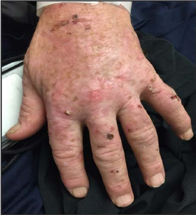
Figure 2. Dorsal aspect of hand with multiple hypopigmented, atrophic scars, scattered heme-crusted erosions, non-inflammatory, tense vesicles, and few firm white, pearly papules consistent with milia.

to UVA, the urine fluoresces pink to red [2]. This technique fell out of favor owing to lack of sensitivity and specificity for PCT [2].