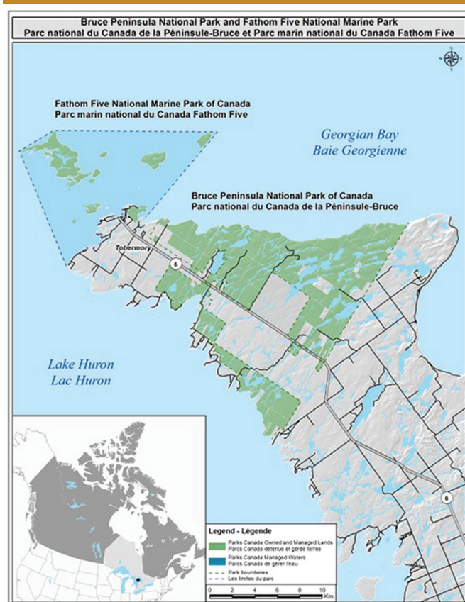
FIGURE 1. The location of Bruce Peninsula National Park and Fathom Five National Marine Park. Inset shows the location of the parks in relation to the rest of Canada. PARKS CANADA

This study includes BPNP and FFNMP (henceforth referred to as “the parks”) because they are administratively managed and operated together. However, they are managed under different legislation and accordingly have different goals. BPNP is managed in the “spirit” of the Canada National Parks Act (2000) because it is not yet officially included under the act and therefore operates under a complex mix of provincial and federal legislation (Parks Canada 2010a). The primary goal of management at BPNP is to maintain ecological integrity (Parks Canada 1998a). Likewise, FFNMP is managed in the “spirit” of the Canada National Marine Conservation Areas Act (2002) because it too is not yet scheduled officially included under the act. The primary goal of FFNMP is ecological sustainability through maintaining ecosystem structure and function (Parks Canada 1998b; Parks Canada 2010b).