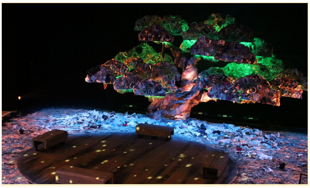
Figure 7: Sotoba Komachi Production Photo 1

brought feelings of wistfulness and joy at first for the viewer. They would work with their own image being captured, distorted, and displayed back to them through retro TVs. Many started to feel an eerie sense of surveillance and discovery the longer they were in the room. In their act of viewing, a separating relationship grew as the TVs began to take on a persona. Each image was being taken from the viewer and they saw a version of themselves causing a moment in which they were both performer and observer. My style had grown into a practice of sustained watching which had translated directly into Epoch. This method of viewing and defining a relationship to space had laid groundwork for an evolution in my theatre work as well.