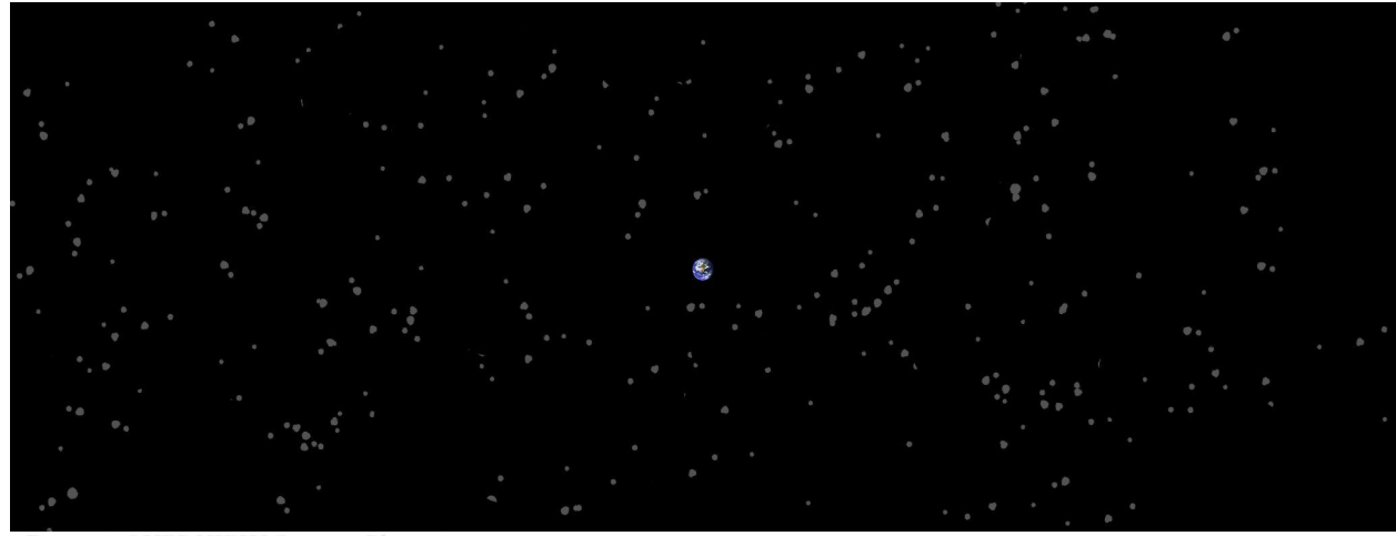
Figure 1: OVERVIEW Concept Photo 1

One of my first forays into a new medium is a project called OVERVIEW. Having pivoted to online learning in Spring of 2020, there were two classes (Kinetic Art and Installations) that gave me an opportunity to explore ideas. Both courses allowed me to examine space and the act of looking. It was here that OVERVIEW took form. I wanted to find new ways of seeing our surroundings since everyone was frozen inside and on screens. What came to mind was the furthest physical place from the physical state that we were in; the cosmos.