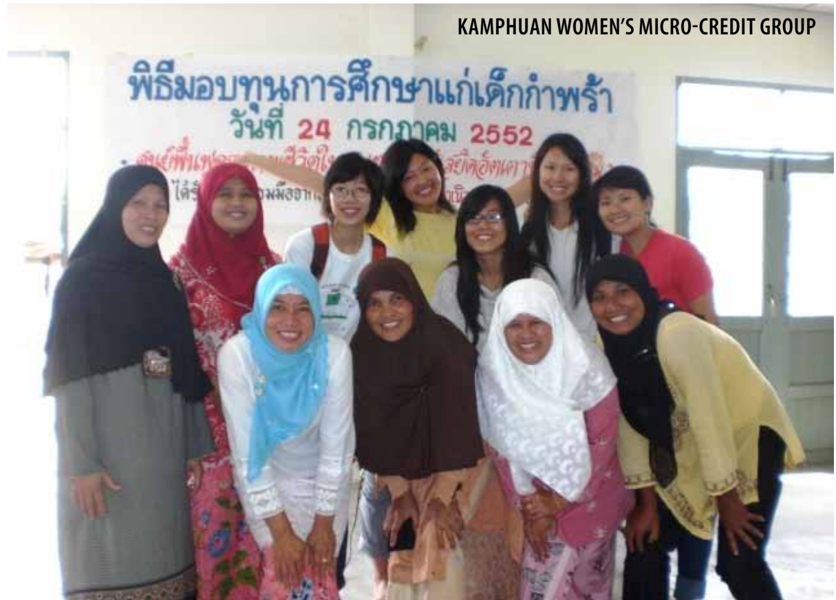
KAMPHUAN WOMEN'S MICRO-CREDIT GROUP

women stated they did not feel powerful enough, compared to men, to induce systemic changes within their community. One of their keys to creating change has been the success and sustainability of their micro-business activities, which ensures supplementary household income, and often provides economic clout to transform their role in the community from wage laborers or housewives to significant financial contributors to public health and educational initiatives. For example, they now have sufficient money to keep their children in school beyond the primary grades, and significantly, keep their girl-children in school to get an education they need to improve their opportunities. While the Royal Thai Government and the King's family support some economic and educational programs, and international organizations such as USAID funded credit programs immediately after the tsunami, these resources have little long term impact to change the community's dynamic of relying on natural resource extraction for economic well-being: an economic system that favors men's roles over women's. Many of the women we worked with feel that they need