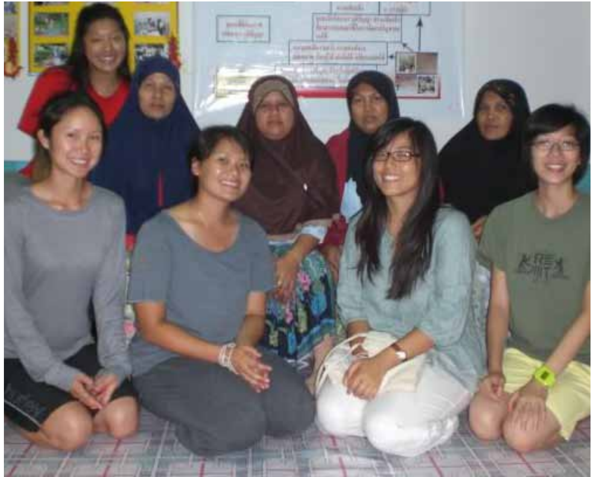
KAMPHUAN TIE-DYE GROUP DIALOG

W.I.L.L. is fundamentally about willpower—a capacity held by all individuals, regardless of ethnicity, history, age, or gender, which can be strengthened by community and institutional support. Development requires not only collaboration, but also care and personal connection among all those involved: government institutions, the international community, the marketplace, and most importantly, local communities themselves. Ultimately, W.I.L.L. is not only a network for selling and distributing unique handicrafts, but moreover, an awareness-raising project that will strengthen community-based women’s participatory development. W.I.L.L. plans to offer the Kamphuan women’s customized products to UCLA through Net Impact Undergrad, a student organization that supports social entrepreneurship. All proceeds go directly to these artisans. For more information contact us at “Women’s Initiative”(locallivelihoods@gmail.com).