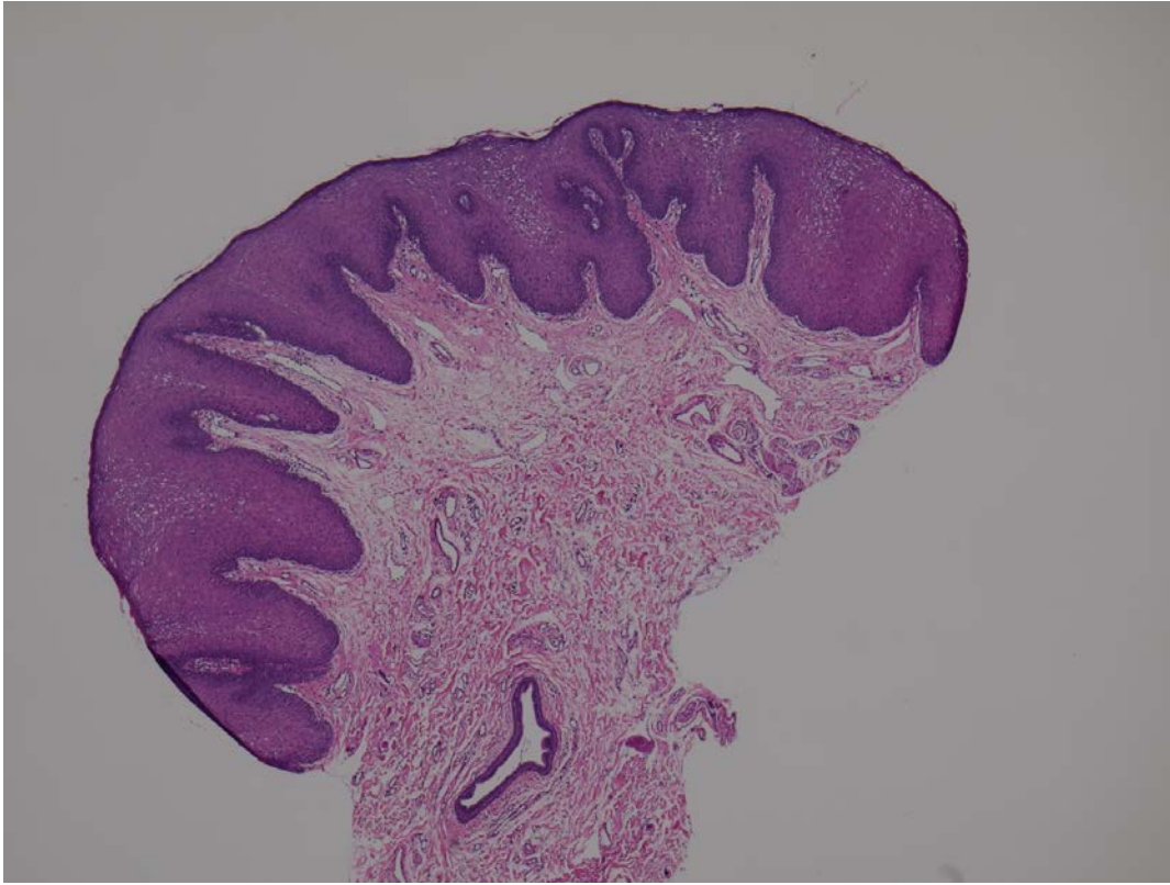
Figure 3. Hematoxylin and eosin (H&E)- stained section ( \times 4 ) shows acanthotic epithelium with thickening and elongation of the rete ridges.

Pathology: the hematoxylin and eosin (H&E)- stained section showed acanthosis with thickening and elongation of the rete ridges. Some of the club shaped rete ridges were confluent to each other. (Figure. 3)