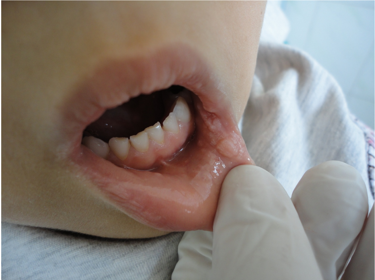
Figure 5. Multiple, soft, discrete papulonodules on the left buccal mucosa and inner surface of lower lip

A 4-year-old-girl presented with a 1-year history of asymptomatic papules in her mouth. Physical examination revealed multiple, soft, discrete papulonodules measuring 2 to 7 mm. The lesions were mucosa-colored and located on the left buccal mucosa and inner surface of the lower lip. There was no family history of similar lesions. The parents did not give consent for a biopsy. The diagnosis of multifocal epithelial hyperplasia was established based on typical clinical features (Figure 5).