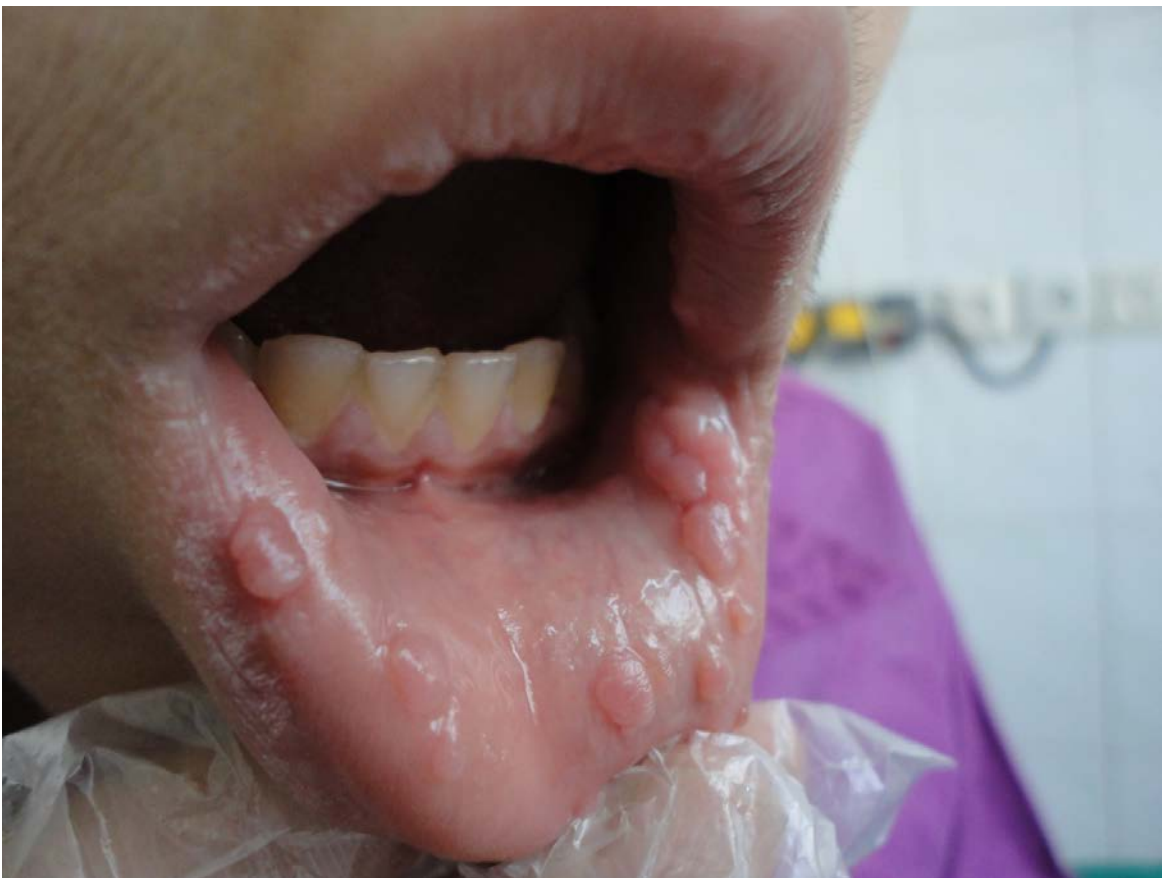
Figure 2. Multiple soft pink papules on the lower lip mucosa.