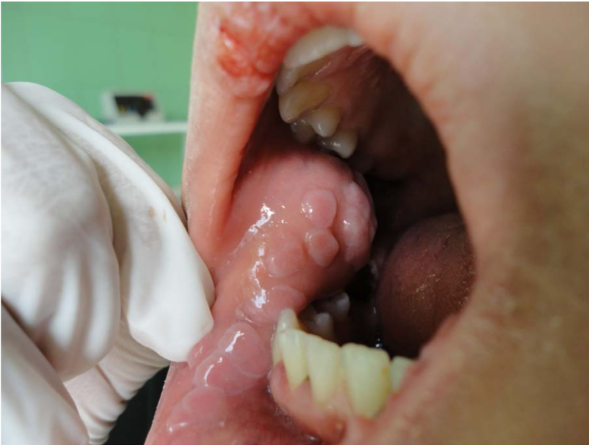
Figure 1. Several smooth-surfaced papules on the buccal mucosa

revealed the presence of similar oral lesions on her 14-year-old brother. The lesions were located on the lateral border of tongue and inner aspect of his lower lip. (Figure. 2)