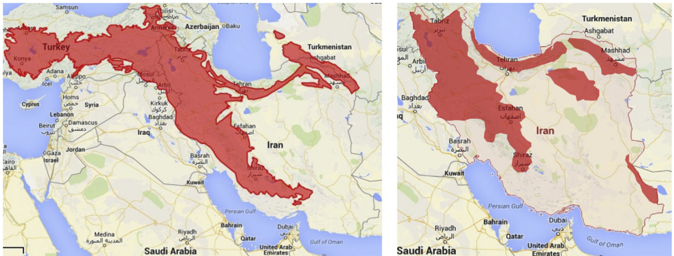
Fig. 1. Left, Irano-Anatolian hotspot region; Right, an estimation of geographic distribution for Fritillaria spp. throughout Iran.

Iran is a land of extremes; altitudes range from 5604 m on Mount Damavand's summit (Kharazipour, 2009) to 28 m below sea-level on the shores of the Caspian Sea (Akhani and Ghorbanli, 1993). The cold climates of the Zagros range, running from the northwest to the south, are replaced by the hot desert climates to the center and east. Mean January temperatures range from 20 °C along the Persian Gulf in Hormozgan province to about –11 °C in Chaharmahal & Bakhtiari (C & B) province. Dry lands of the interior areas change suddenly to the wet and moderate coastal climates of the Caspian coastal areas; the lush Caspian forest may receive an annual rainfall of 1950 mm, whereas lifeless sand-dunes of the 'Lut' remain arid (~30 mm annual rainfall).