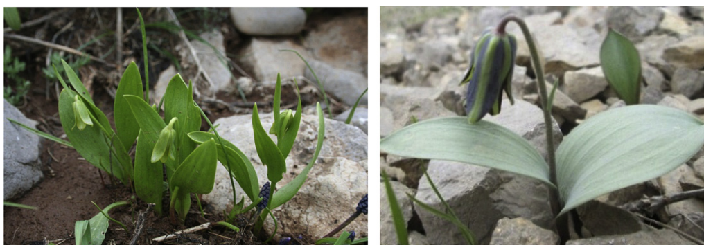
Fig. 10. Left, F. chlorantha; Right, F. avromanica.

Bulb : up to 2 cm in diameter, bulbils few, without stolons. Stem : 4–10 cm, papillae absent. Leaves : 4–10, usually 5, broad, shiny green, not glaucous, all alternate, the lowest ovate broadly lanceolate, 6–10 × 1.2–5 cm, the upper linear-lanceolate ca. 5 cm long. Flowers : 1–2, narrowly campanulate; perianth segments green outside, yellowish sometimes with purple markings inside and on the inner segments, rarely purple outside, the outer 15–25 × 3–4 mm, the inner somewhat wider. Nectaries : 3 × 1 mm, lanceolate, 1 mm above the base of the segment, green. Filaments : 6–7 mm, swollen, densely papillose; anthers 6–7 mm. Style :