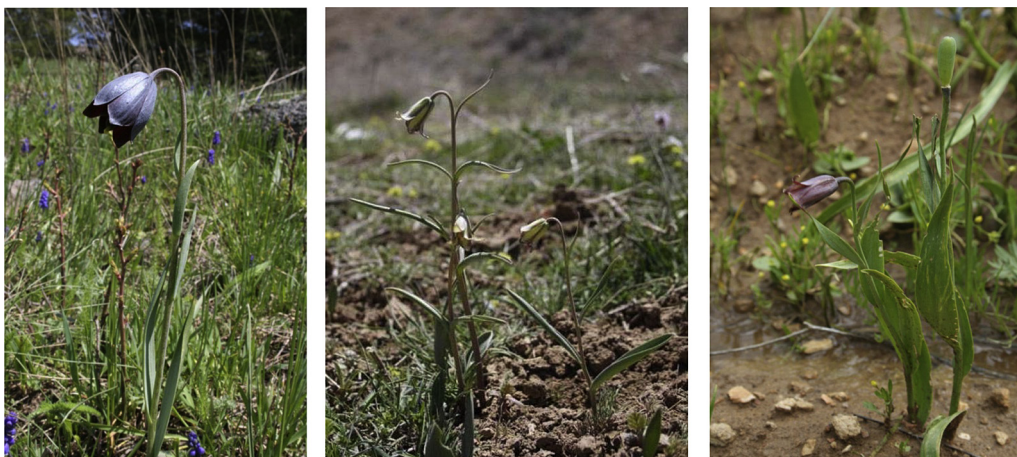
Fig. 8. Left, Caucasian lily ( F. caucasica ); Center, F. assyriaca ; Right, F. cf. uva-vulpis.

Bulb: up to 2 cm in diameter, ovoid, sometimes with few bulbils, without stolons. Stem: 4–10 cm, rarely over 10 cm, papillae sometimes present, lowest leaves with a wavy edge. Leaves: 4–7, usually 5–6, smooth, somewhat glaucous, all alternate or the lowest sub-opposite, lanceolate, 3–9 × 0.6–1.6 cm, the lowest narrowly oblanceolate to elliptic-oblong, 5–11 × 1.5–2 cm, usually folded at fruiting time, the uppermost, linear-narrowly lanceolate, 2–5 cm long, acute. Flowers: 1–2(-3), narrowly campanulate, with