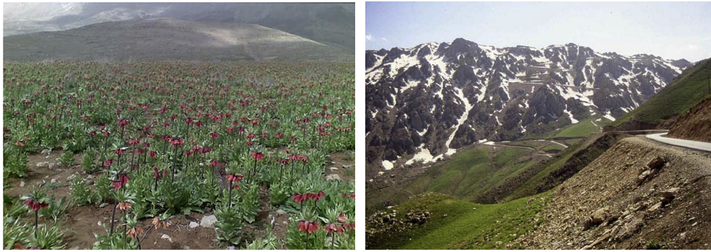
Fig. 12. Left, Koohrang crown imperial plain; Right, Eight-Frit Mountain.

populations of F. straussii on the north side of the slope; F. imperialis on the top of the ridge and a very large F. crassifolia ssp. kurdica on the south-facing side of the slope; F. avromanica grows in the spiny bushes on the west-facing slope below the road on the south side of the cleft; F. poluninii grows in rock crevices in several parts of the pass; F. assyriaca can be found in several places on the slopes on both sides of the pass but a little lower down; F. persica populations are spread on the slopes while descending from the pass on the road towards Nowsud. Such a rich habitat, where members of the four subgenera known to occur in Iran coexist, is believed to be unique in the world (Wallis and Wallis, 2009).