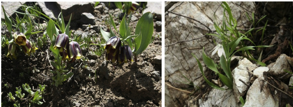
Fig. 5. Left, F. crassifolia ssp. kurdica ; Right, F. poluninii.

Bulb: up to 3 cm in diameter, sometimes with bulbils. Stem: up to 10 cm high. Leaves: 4 (5–7), glaucous, lanceolate or linear lanceolate, all alternate; the lowest is wider than the rest, 3–5 cm long, 6–15 mm wide. Flowers: 1–2 (–4), campanulate, pendant at