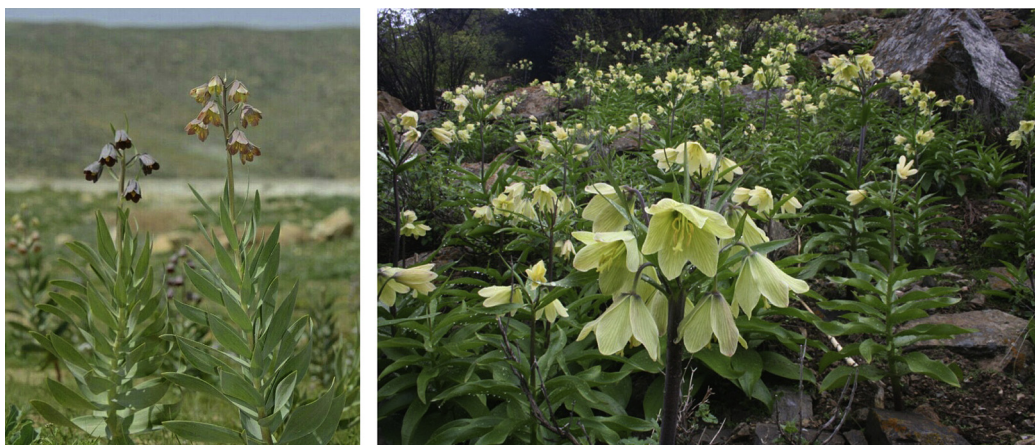
Fig. 4. Left, F. persica; Right, F. raddeana.

Fritillaria persica is the sole member of the monotypic subgenus Theresia . The species has a bulb consisting of only one massive fleshy scale, second in size only to F. imperialis , and numerous flowers on a tall stem. The nectary color largely depends on that of the flower, so that in some populations the nectaries are not very noticeable. Given its striking appearance and geometry, the species can be easily distinguished from other species.