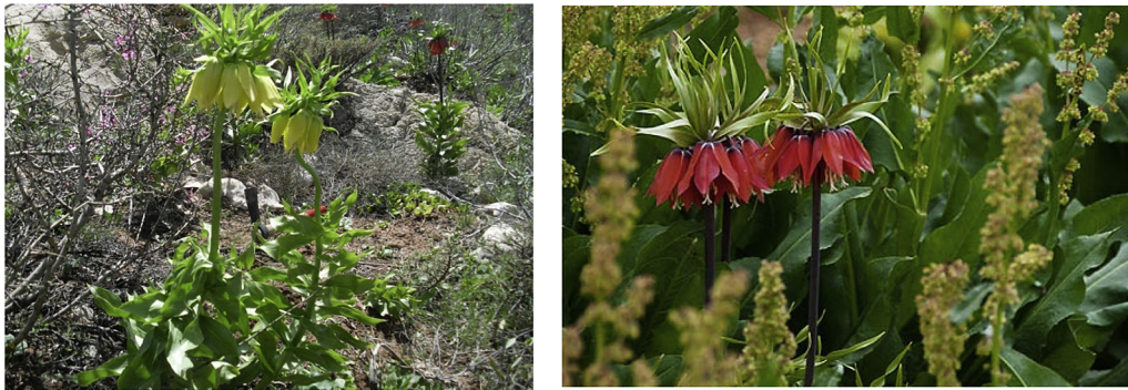
Fig. 3. Left, red- and yellow-colored crown imperials naturally co-exist in the same habitats; Right, crown imperials surrounded by giant Rumex acetosella bushes.

Flowers in the crown imperial (in Persian Taaj-e Khosro ) are at the top of the stem, topped by a crown of small bract leaves, hence the name. In Iran, crown imperial is also commonly known under the local name of ' Ashk-e Maryam ' meaning 'Tears of Mary' (Badfar-Chaleshtori et al., 2012), which refers to the drops of nectar (200–350 µl) that regularly appear at the petal base through the flowering stage, replaceable in less than a day upon extraction. It is also called ' Gel-e Begeriv ' (Weepy flower) amongst local 'Lor' people of C & B and Kohgiluyeh & Boyerahmad (K & B) provinces, two provinces with a remarkable share of the distribution.