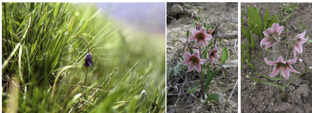
Fig. 11. Left, F. chlororhabdota; Center, F. gibbosa; Right, F. ariana.

Among the species belonging to the Caucasica group, Fritillaria chlororhabdota seems to be closest to F. caucasica , by phyllotaxy (position and number of the leaves) as well as shape and its external purplish color of the tepals. However, the species can be distinguished from F. caucasica by several characters, e.g., folded leaves at fruiting time, narrowly campanulate flowers, obtuse tepals with a median green stripe on the inside, wide lanceolate nectaries, shorter filaments, rough pollen exine with big luminae and an entire stout style. In contrast, F. caucasica has flat leaves during the whole of vegetative period, acute tepals (sometimes inner ones obtuse) that are paler purple inside (sometimes greenish) and without a green stripe along the whole of their length, linear-lanceolate nectaries, longer filaments, smooth pollen