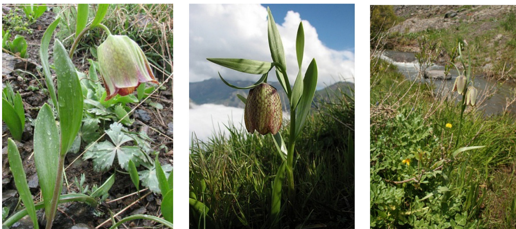
Fig. 7. Left, F. kotschyana ssp. kotschyana ; Center, F. kotschyana ssp. grandiflora ; Right, F. olivieri.