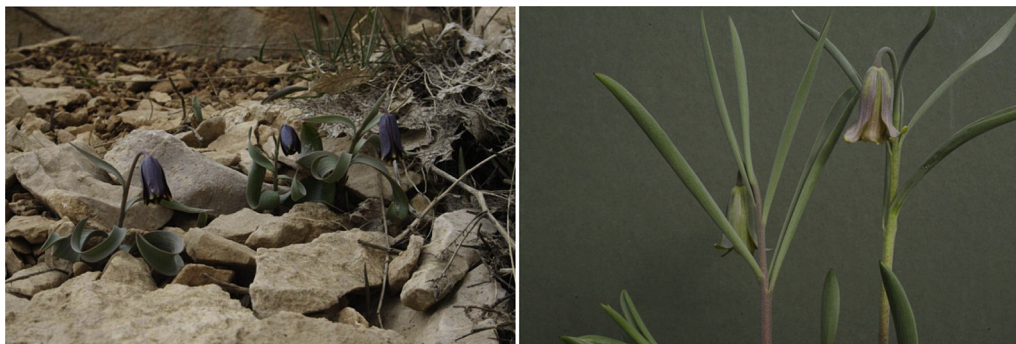
Fig. 9. Left, F. zagrica ; Right, F. atrolineata.

few warts on the tepal surface; perianth segments 12–18 mm, outside and inside dark purplish-brown with a yellowish tip, and a waxy bloom outside, the outer segments, 12–18 × 4–7 mm, elliptic-lanceolate, acute, the inner 6.5–8 mm wide, lanceolate, obtuse. Nectaries : 3.5–5 × 1–1.5 mm, broadly lanceolate to narrowly elliptic, 1 mm above the base of the segments, green-purplish. Filaments : 8 mm, somewhat swollen, papillose; anthers 3–4 mm. Style : 8–9 mm, slender, papillose or subglobose. Capsule : cylindrical, 2.5–3.5 × 1.5–5 cm, obovoid, obtuse, tapering towards the base, not winged. Flowers March to May.