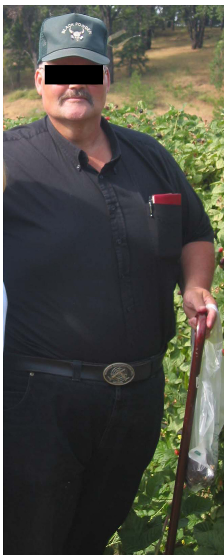
Figure 1. Patient's photograph.

The autopsy findings were remarkable for multiple architectural cortical abnormalities including bilateral abnormal gyration or gyri crowding; mild enlargement of the left lateral ventricle; broad thinning of the cortex, more prominent in rostral cortex (3 mm); thin corpus callosum, mainly at its posterior level (0.4–0.5 mm); and