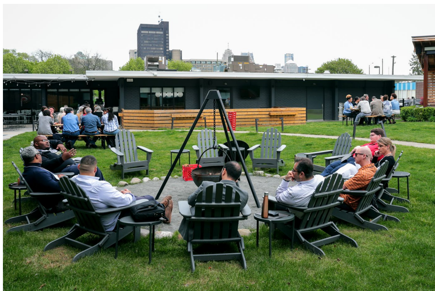
Picture 4 Participants Conversing during Story Circle Time at the Symposium

presentations. However, participants mentioned focused smaller discussion groups provided opportunities to “dive deep” and establish relationships with other faculty (Picture 4).