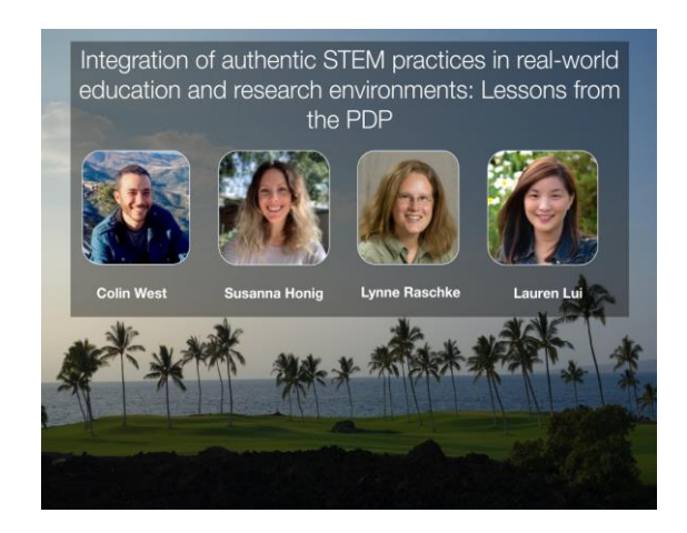
Figure 4: Panel introduction slide at the ISEE conference on Advancing Inclusive Leaders in STEM.

provide a structure to make such interventions both equitable and effective.