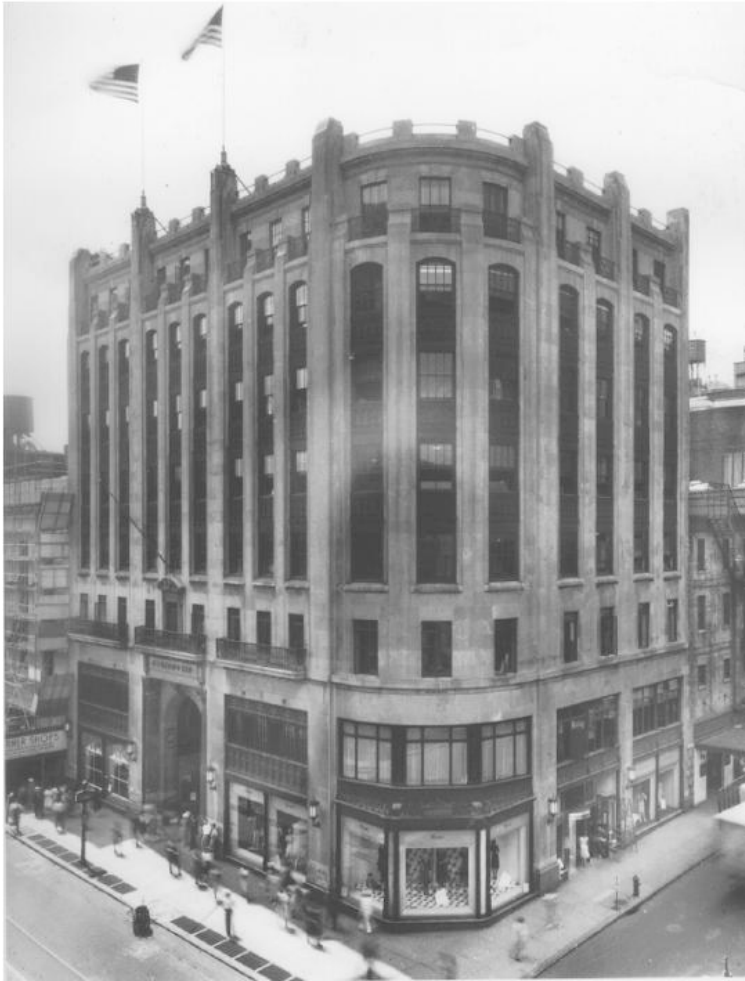
Image 7 I. A. Namm department store, New York City