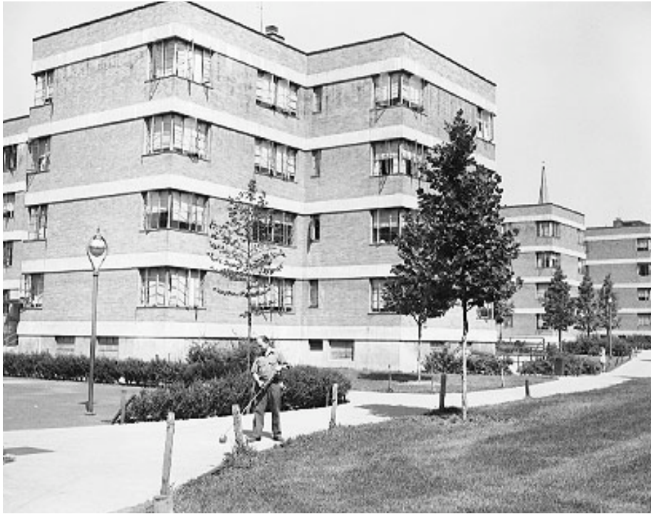
Image 10 Williamsburg Houses, New York City