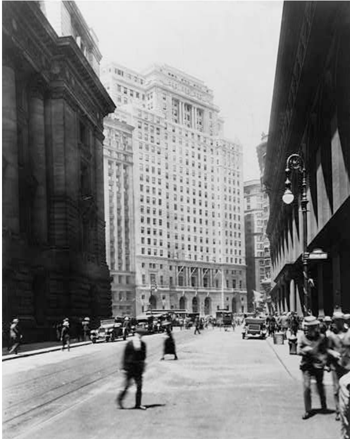
Image 6. Cunard Building, New York City