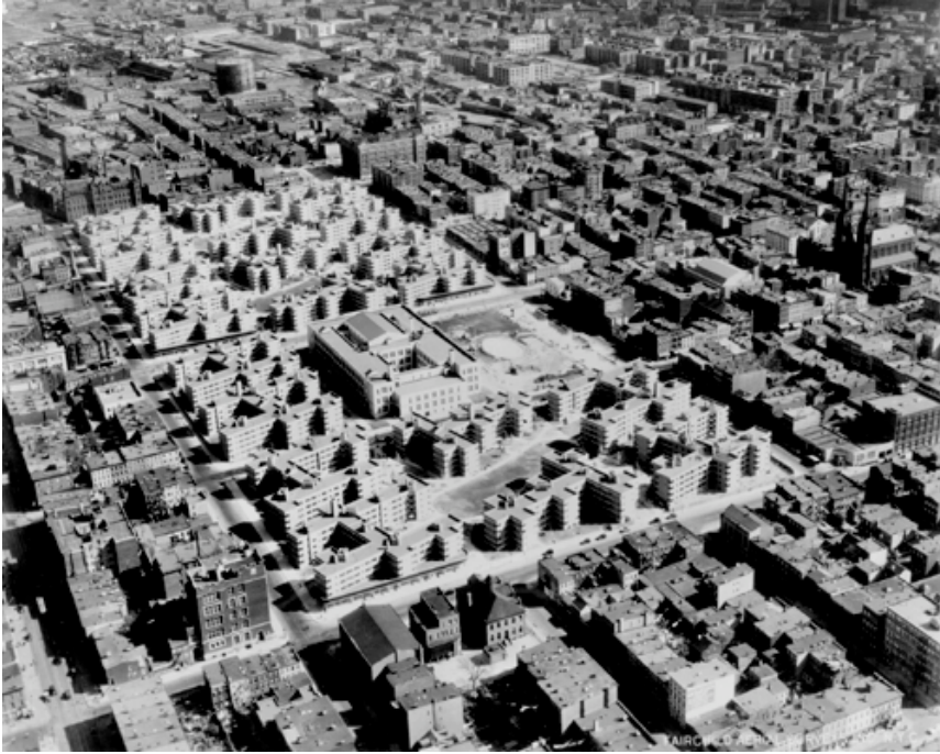
Image 9 Williamsburg Houses, New York City