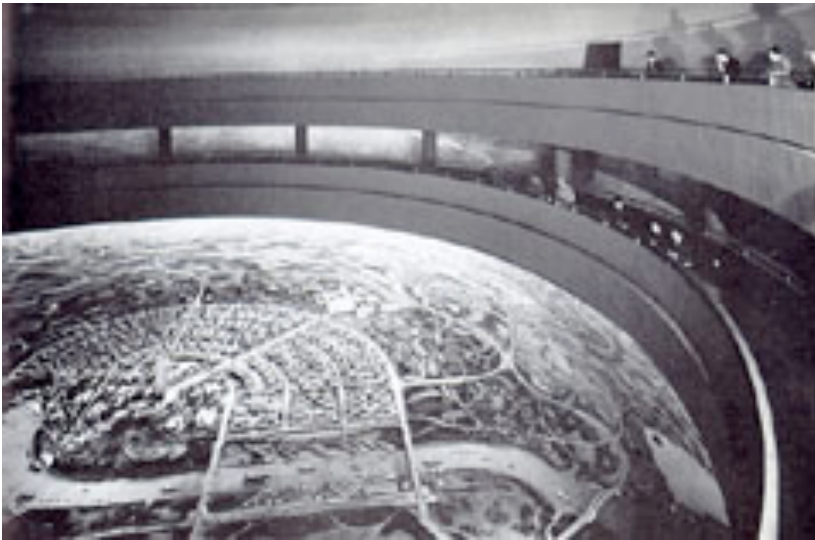
Image 12 Democracy exhibit at the New York World's Fair of 1939-40