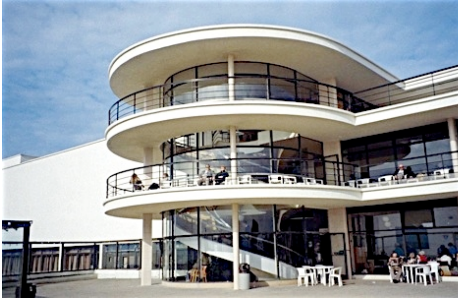
Image 13 De La Warr Pavilion, Bexhill-on-Sea, East Sussex, England