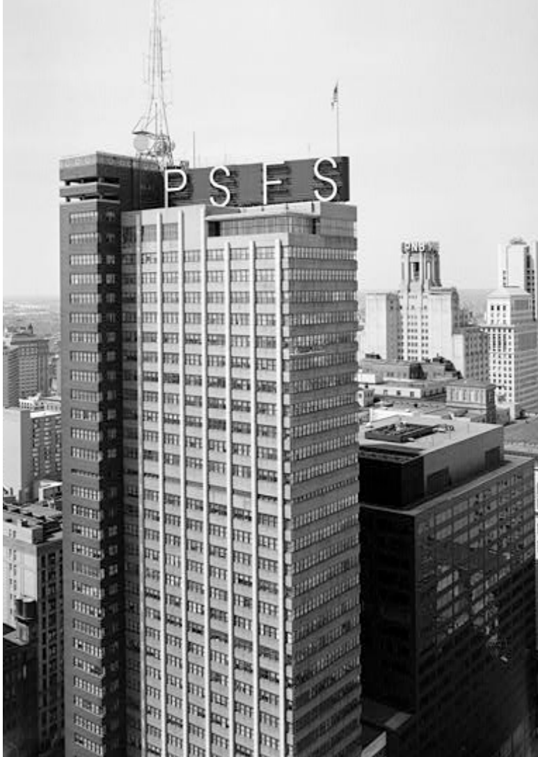
Image 8 Philadelphia Saving Fund Society (PSFS) building, Philadelphia