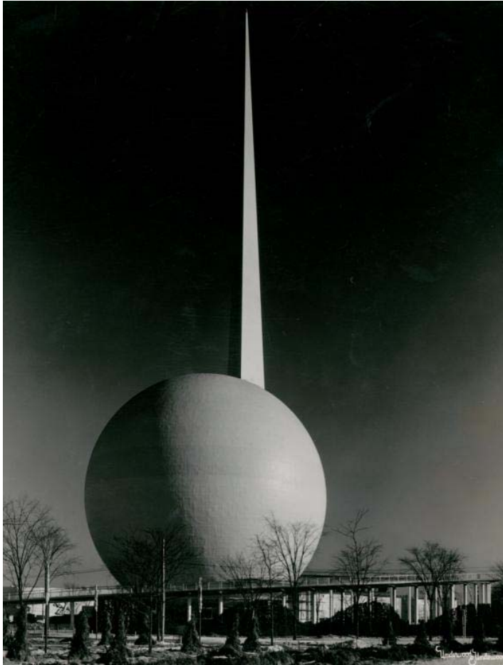
Image 11 Perisphere and Trylon at the New York World's Fair of 1939-40