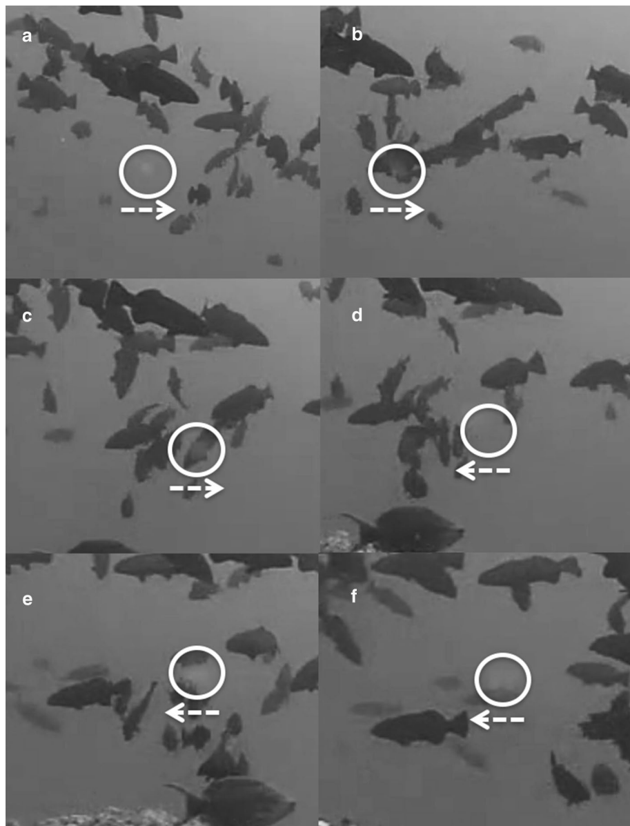
Fig. 1 Sequence of still frames (a–f) extracted from Additional file 2 of Karkarey et al. [1] showing the location (white circle) and the general direction of movement (white arrow) of the particle misrepresented as a gamete cloud. Please note that Fig. 2d in Karkarey et al. [1] would occur between the still frames in (c) and (d)

for this species". This explanation differs greatly from those by Johannes et al. [2] and the individual authors listed therein, who based their explanation on decades of combined experience of grouper mating from numerous spawning aggregations in multiple locations globally, in addition to the several years of continuous surveys and observations of P. areolatus at the site of their reported research. Descriptions by Johannes et al. [2] of interactions between territorial males and roving female schools closely resemble the sequence of behaviors that can