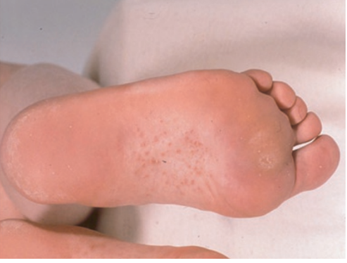
Figure 1 Palmar and plantar pits in juvenile patients with nevoid basal cell carcinoma syndrome.