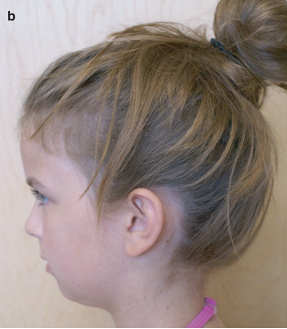
Figure 3. Craniofacial manifestations of nevoid basal cell carcinoma syndrome (NBCCS). (a) Macrocephaly, synophrys, epicanthic folds, basal cell nevi, and (b) micrognathia in a young girl with juvenile NBCCS. The patient provided assent for the use of her photographs in this article, and her mother provided consent.

We believe that molecular testing is a valuable part of an NBCCS diagnosis; however, many patients still face barriers to molecular testing for various reasons including cost and limitations of insurance coverage. Therefore, thorough clinical diagnostic criteria are critical. Our study compared clinical features in affected individuals with their unaffected siblings and provides useful guidelines on the utility of clinical evaluations in the diagnosis of NBCCS.