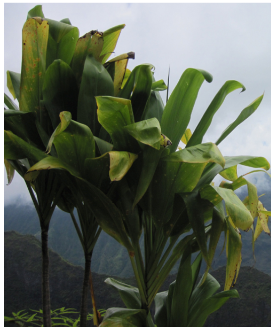
FIG. 1. Cordyline fruticosa, ti.

Studies of introduced taxa brought by the voyaging Polynesians could be a source of evidence to understanding the culture and colonization of islands. Though the origin of C. fruticosa is not known, it may have