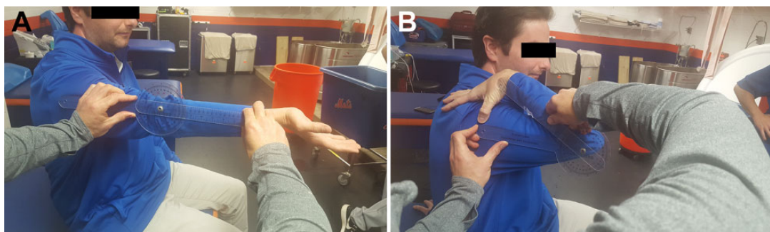
Figure A2. Measurement of elbow (A) extension and (B) flexion.