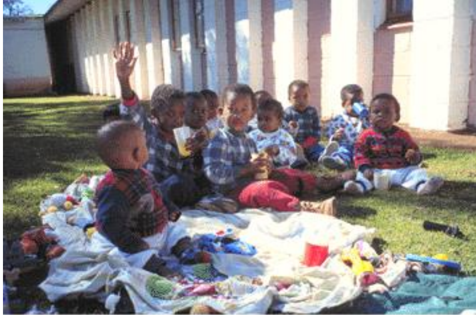
Infants at the Lily of the Valley HIV-Hospice for orphans near Durban. This is the first site for the field test of UV Waterworks in South Africa (August, 1997).

The first results from the field show that UV Waterworks successfully treated contaminated groundwater from the borehole on which the hospice depends. Before entering the UV Waterworks unit, the water contained an average of 4000 colony forming units (CFU) per 100 mL, including 200 fecal coliforms per 100 mL. Water leaving the unit showed no detectable coliforms. The UV Waterworks unit indeed seemed to be eliminating all bacteria of concern in this case.