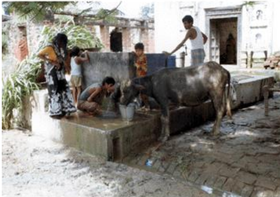
Site: Bhupalpur, India. Standing villager using handpump that supplies water to UV disinfection unit (inside cement structure).

Our goal was to disinfect communities' drinking water collected by hand from surface sources, or with handpumps. The water entering the device might have a pressure of only a few centimeters of water column. Thus, we decided to do away with any integrated filter (and the need for pressurized water to push it through the filter). If filtering was necessary, it would have to be done outside the device, using a slow sand filter, or an in-line filter cartridge if one had a pressurized line. We circumvented the sleeve fouling problem with a design having a bare UV lamp supported below a reflector, above the free surface of flowing water. There are no solid surfaces prone to fouling between the water and the UV lamp. We set the maintenance interval of the design conservatively at 6 months. Our initial design was wholly of welded stainless steel sheet, consumed 40 Watts, disinfected 30 liters per minute (lpm), and cost about US$900.