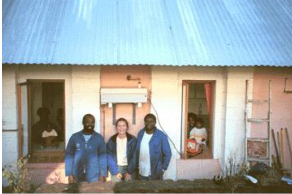
UV Waterworks unit installed on the exterior wall of the kitchen at the Lily of the Valley HIV-Hospice near Durban, South Africa. A few orphans and their caretakers can be seen in the kitchen windows. Durban Metro Water plumbers and a Berkeley Lab researcher stand below the just installed unit (August, 1997).

After initial testing of the device using the laboratory facilities of the municipal water utility supply in Durban, we installed the device at the first test site in July 1997 ( Figure 5 ). The test site is in a rural area near Durban, at a hospice for abandoned infants who have tested positive for the HIV antibody. These infants presumably received the antibodies from their HIV-infected mothers; many of them turn out to not be infected with the actual virus. Still, a number of the infants do ultimately test positive for HIV, and through the hospice's history, 20% of its patients have died from AIDS complications. Providing clean drinking water for these high-risk children is a very significant step toward improving their chances of living with HIV ( Figure 6 ).