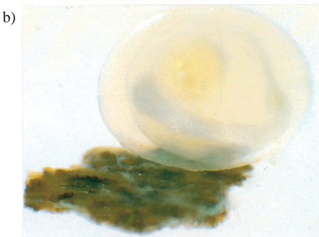
Fig. 1. Tessellated darter embryos recovered from the stomachs of cannibalistic nesting males. Such remains suggest that the embryos were generally in good health before being eaten and probably had been free of fungal disease (see ref. 18). (a) This embryo (displaying spotted pigment areas) was retrieved from the stomach of its biological father; the yolk sac can be seen above the prominent eyes and below the long curved tail. (b) This embryo and egg case, also retrieved from the stomach of its sire, was cemented to a small piece of black wood from the nest, suggesting that it may have been attached to the nest at the time of consumption (see text).

cannibalism indicate that this behavior "occurs on a scale that exceeds the simple consumption of diseased or dead eggs" (11). Second, perhaps the darter embryos eaten by their guardian males were already physically dislodged from the nest and would otherwise have washed downstream and died. We cannot eliminate this possibility, but it is worth noting that some of the embryos retrieved from the males' stomachs were still secured to small pieces of wood from the nest (Fig. 1b), suggesting that they had not dislodged naturally.