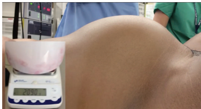
Figure 2. Photograph of patient before hysterectomy for a 2-kg uterus.