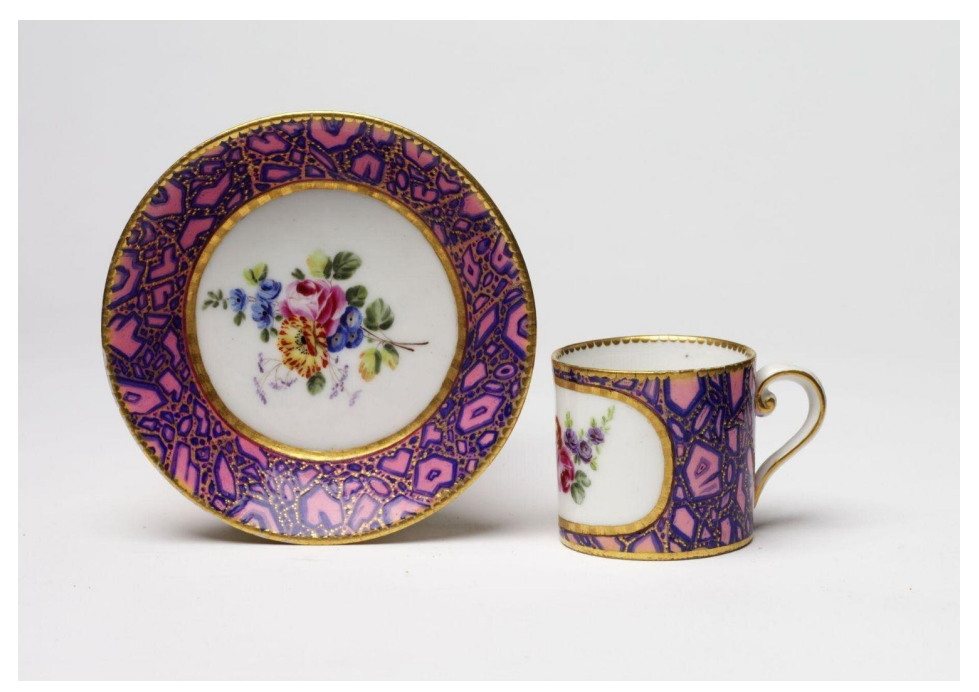
Figure 14. Sèvres Porcelain Factory, Painted by Guillaume Nöel, Soucoupe, 1761, soft-paste porcelain, (Victoria and Albert Museum, London)