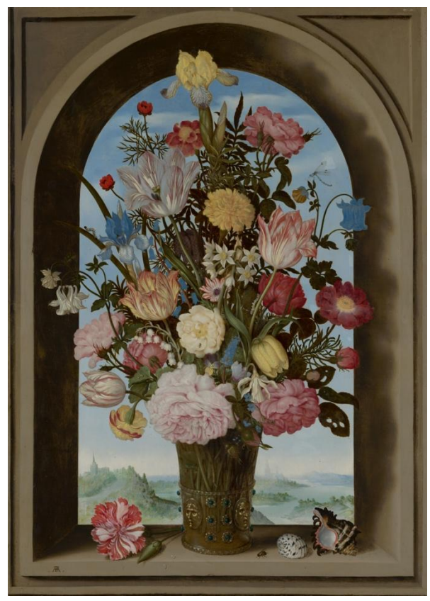
Figure 16. Ambrosius Bosschaert de Oude, Vaas met bloemen in een venster, 1618, oil on panel, (Mauritshuis, The Hague).