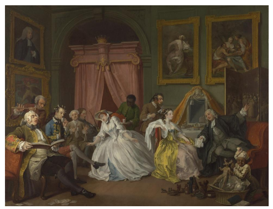
Figure 2. William Hogarth, Marriage A-la-Mode, The Toilette , 1743, oil on canvas (The National Gallery, London).