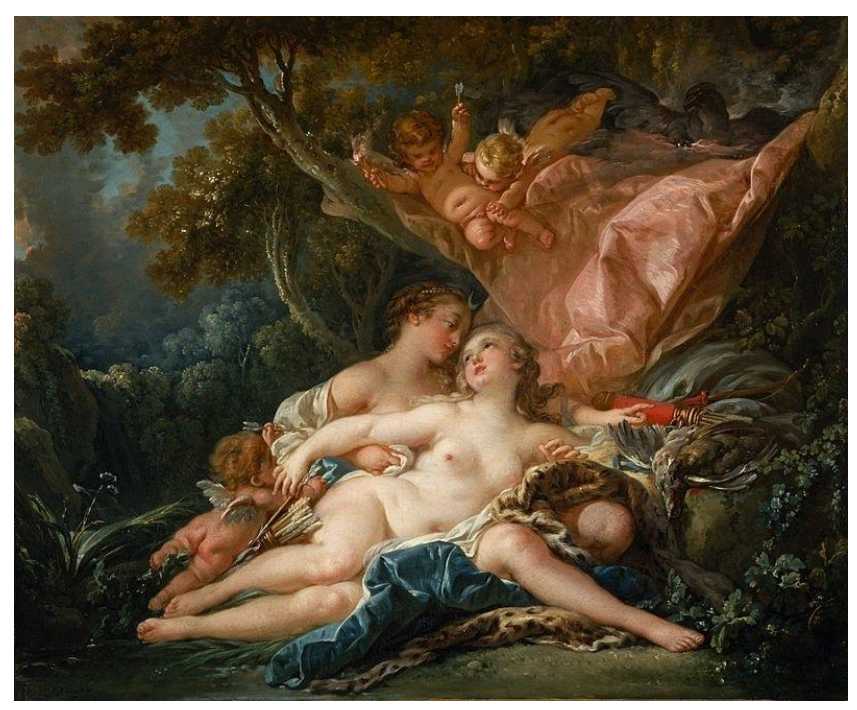
Figure 6. François Boucher, Jupiter in the Guise of Diana, and the Nymph Callisto, 1759, oil on canvas, (Nelson-Atkins Museum, Kansas City, MO).