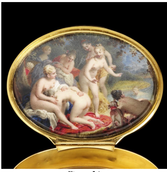
Figure 24. Interior of Figure 23.