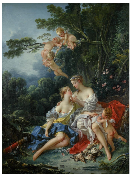
Figure 7. François Boucher, Jupiter and Callisto , 1744, oil on canvas, (Pushkin Museum, Moscow).