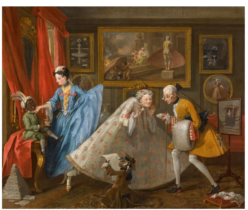
Figure 3. William Hogarth, Taste of High Life , 1742, oil on canvas, (Private Collection).