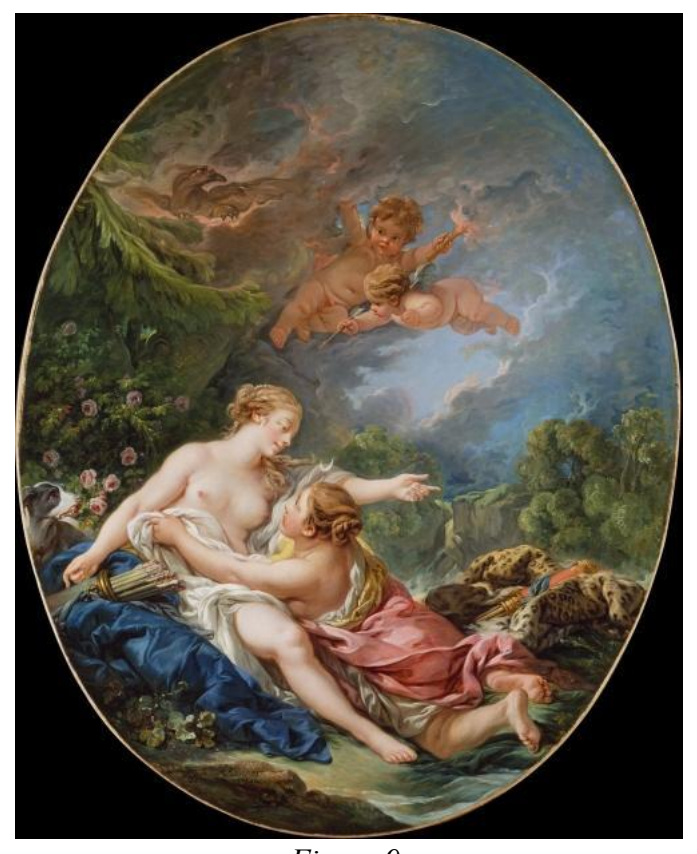
Figure 9. François Boucher, Jupiter and Callisto , 1969, oil on canvas, (Wallace Collection, London).