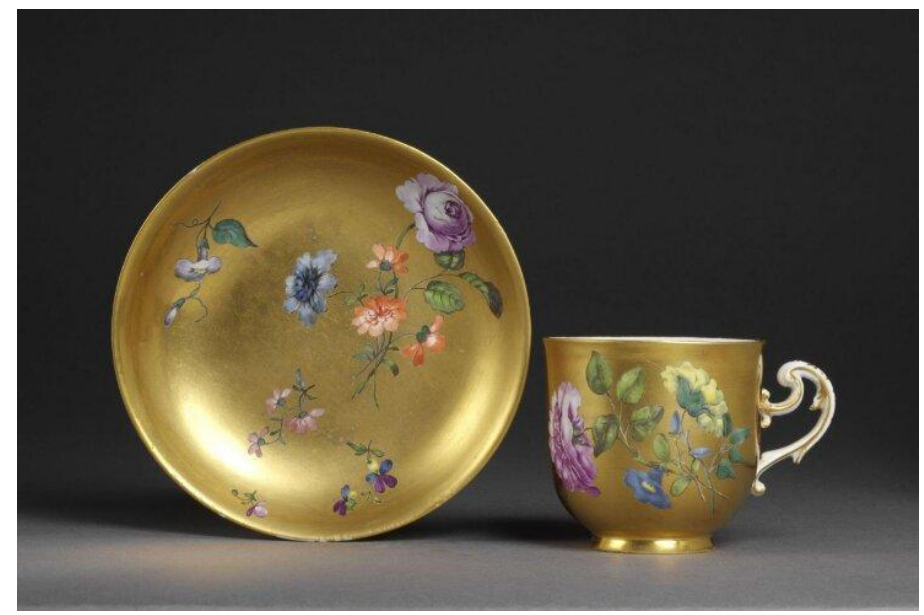
Figure 15. Meissen Porcelain Factory, Coffee Cup and Saucer, 1750, soft-paste porcelain, (Victoria and Albert Museum, London).