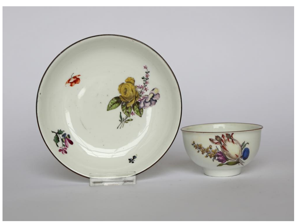
Figure 12. Meissen Porcelain Factory, drinking-cup; saucer, 1745-55, soft-paste porcelain, (British Museum, London).