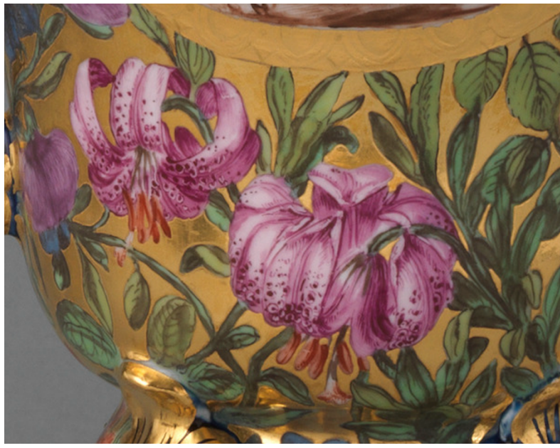
Figure 20. Detail of Figure 1 with pink lily.