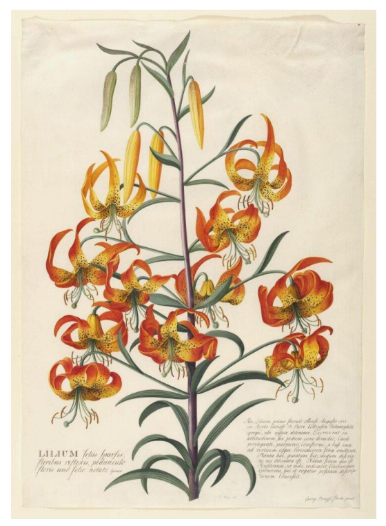
Figure 19. Georg Dionysius Ehret, American Turk's-cap lily (Lilium superbum) , 1740s, watercolor and bodycolor on vellum, (Victorian Albert Museum).