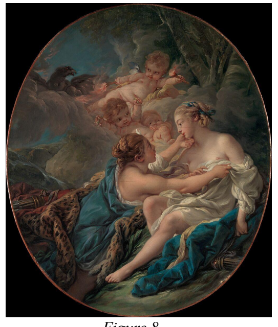
Figure 8. François Boucher, Jupiter in the Guise of Diana, and Callisto, 1763, oil on canvas, (Metropolitan Museum of Art, NYC).