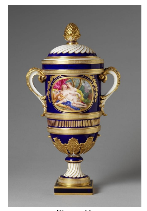
Figure 11. Sèvres Porcelain Factory, vase Bachelier à anses et à couronnes , 1770, soft-paste porcelain, (Victoria and Albert Museum, London).