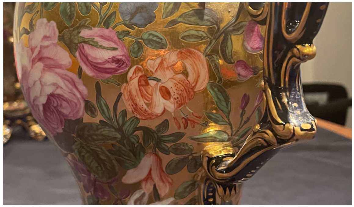
Figure 21. Detail of Figure 4 with orange "tiger lily."