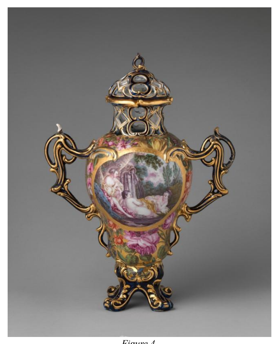
Figure 4. Chelsea Porcelain Manufactory, Perfume vase with three nymphs (one of a pair), 1761, soft-paste porcelain, (Metropolitan Museum of Art, NYC).