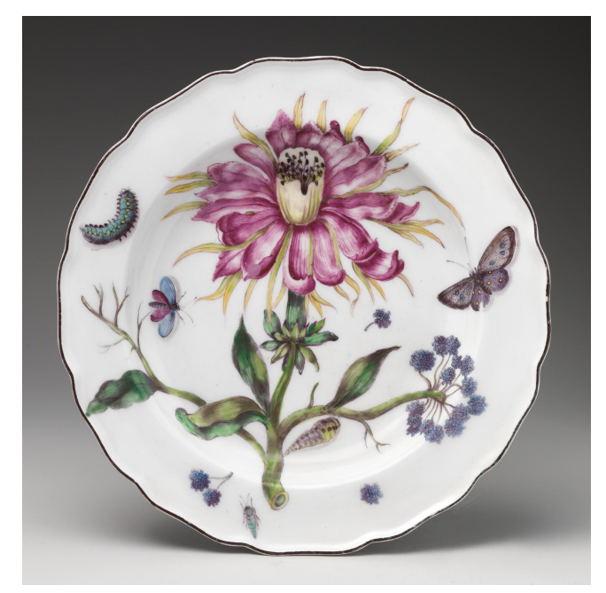
Figure 13. Chelsea Porcelain Manufactory, Botanical plate with thistle, 1755, soft-paste porcelain, (Metropolitan Museum of Art, NYC).