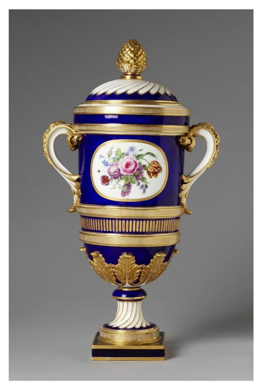
Figure 22. Reverse side of Figure 11.