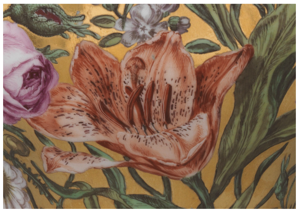
Figure 18. Detail of Figure 1 with orange "tiger lily."