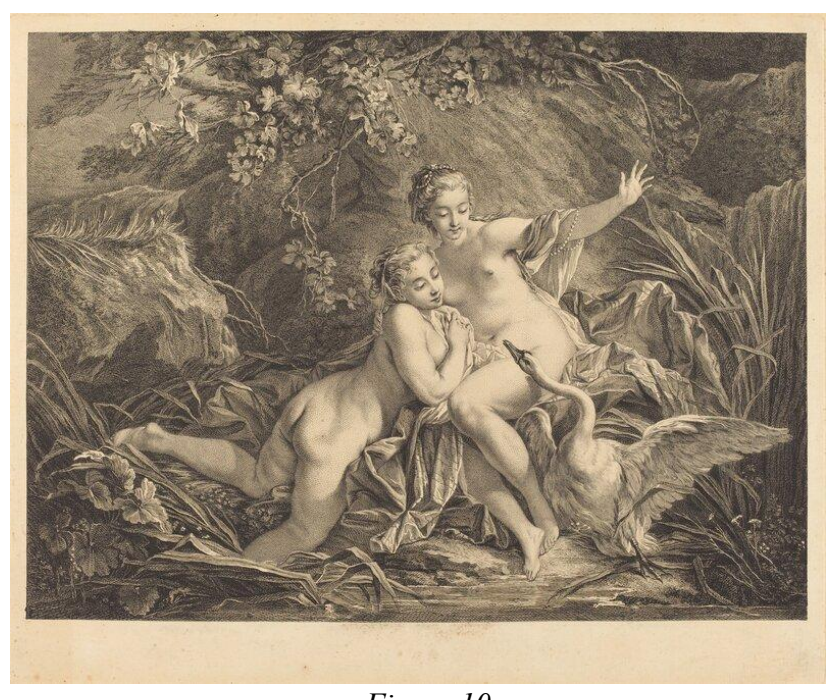
Figure 10. François Boucher, Jupiter and Leda , 1758, engraving, (National Gallery of Art, Washington, D.C).