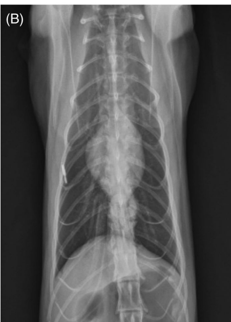
FIGURE 1 A, Left lateral thoracic radiograph of a cat with Type I hiatal hernia. Note the soft tissue opacity in the caudodorsal thorax. B. Ventrodorsal thoracic radiograph of a cat with Type I hiatal hernia. Note the soft tissue opacity in the caudodorsal thorax on the lateral view (A) and the inability to discern the hernia on the VD view (B), consistent with intermittent herniation that changes with patient positioning

predominantly in the distal esophagus in 4 cats and throughout the esophagus in 2 cats. Nineteen (61.3%) cats underwent contrast esophagography and upper gastrointestinal radiographic studies using barium or iohexol, and 17 of 19 cats (89.5%) cats were diagnosed with HH. Caudal pectus excavatum, pleural effusion, cardiomegaly, and a single pulmonary nodule also were seen in 1 cat each. Thirteen (41.9%) cats underwent videofluoroscopic swallowing studies using barium paste with food or liquid barium. Findings included rugal folds or the gastroesophageal junction (GEJ) positioned cranial to the diaphragm in 13 of 13 (100%) cats, intermittent herniation during retching in 1 of 13 (7.7%), esophageal dilatation in 4 of 13 (30.8%), GER, hypomotility in 3 of 13 (23.1%), and dysmotility in 2 of 13 (15.4%) cats. Six (18.2%) cats underwent upper gastrointestinal endoscopy. Abnormalities included edema and erythema of the esophageal mucosa consistent with esophagitis and reflux of gastric fluid through the GEJ in 4 of 6 (66.7%) cats. Fifteen (48.4%) cats underwent abdominal ultrasonography. Abnormalities included type I HH in 8 of 15 (53.3%) cats, and small, irregular, or